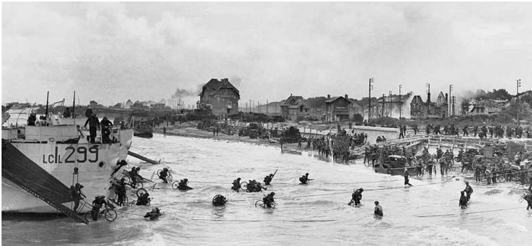
Canadian troops disembarking at Bernières, Juno Beach

Two days of sightseeing in the area of the Normandy Beaches where Allied forces landed on D-Day, June 6, 1944. We focus on the Canadian sector, Juno Beach , where we visit the towns of Bernières and Courseulles, the Juno Beach Centre, and Bény-sur-Mer Canadian War Cemetery. Other sights included will be Ardenne Abbey, with its memorial to Canadian POWs executed there by SS troops; Bretteville Canadian War Cemetery, in the area where the battle of the Falaise Gap was fought; remains of the artificial Mulberry Harbour in Arromanches; the famous Pegasus Bridge; the huge American Memorial at Omaha Beach; and the town of Bayeux, where we will view the famous Tapestry, depicting William the Conqueror’s 1066 conquest of England. No group dinners scheduled for days 13 and 14.