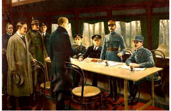
November 11, 1918: The Armistice is signed in Rethondes

Departure from Honfleur after breakfast. We motor to Rethondes , a hamlet in the Forest of Compiègne where the Armistice was signed on November 11, 1918 in the railway carriage that served as HQ of Allied Commander in Chief, Marshal Foch; it is also here that the French capitulated on June 22, 1940 ( http://en.wikipedia.org/wiki/Armistice_with_Germany_%28Compi%C3%A8gne%29 ). Afterwards we enjoy a gourmet Au Revoir lunch in a traditional country restaurant. Then we cross back into Belgium for our overnight in the Holiday Inn hotel near Brussels Airport.