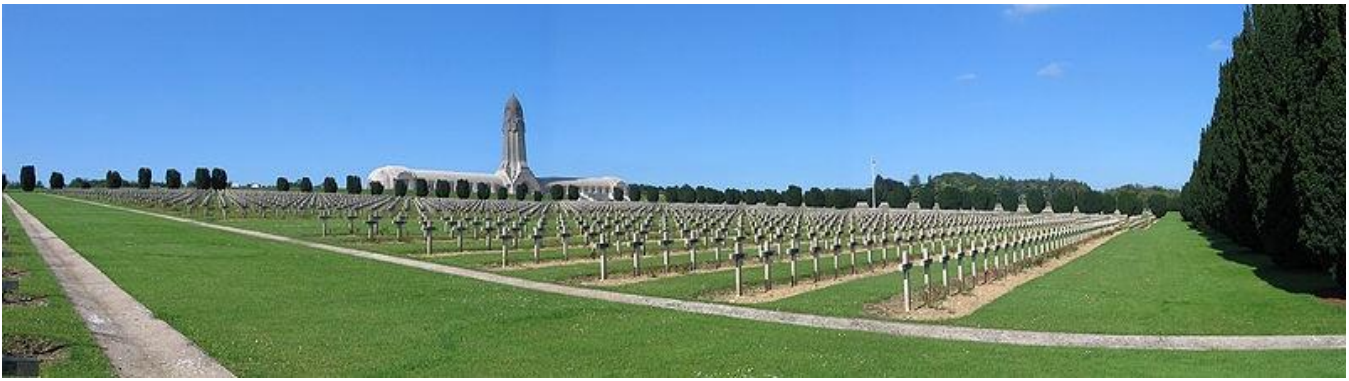
Panoramic view of Douaumont Ossuary near Verdun