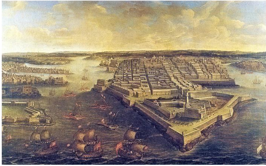
< Panoramic view of Valletta in 1801

Infirmary,' located beneath the Mediterranean Conference Centre with a capacity of over 600 beds a state-of-the-art hospital at the time of its establishment by the Order in 1574. Dinner tonight is on your own.