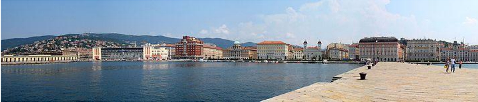
Trieste's glorious waterfront

Pauwels Travel Bureau Ltd. 55 Dufferin Ave, Brantford, Ontario N3T 4P6 Tel: 519-753-2695/1-800-380-3974- Fax: 519-753-6376 tours@pauwelstravel.com – www.pauwelstravel.com