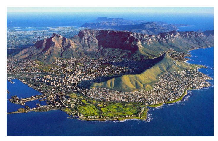
Day 1 - Sunday, November 10: FLIGHT Evening departure from Canada on-route to South Africa with KLM via Amsterdam. Full inflight services including dinner and entertainment provided.