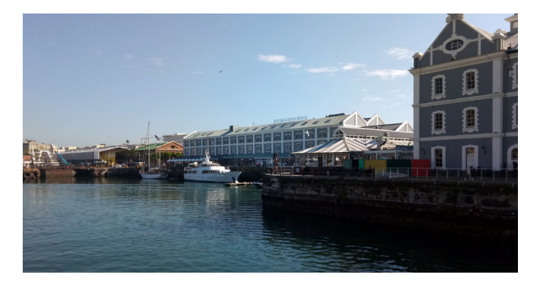
Day 3 - Tuesday, November 12: CAPE TOWN (B, D)

Morning arrival in Amsterdam where there will be a short delay before our connecting flight to Cape Town. Late evening arrival in Cape Town followed by immediate transfer to the hotel situated at the world-renowned Victoria and Alfred Waterfront in Cape Town. This will be our base for the next 4 nights.