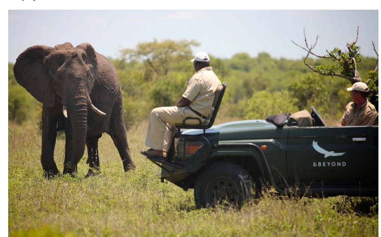
Day 13 - Friday, November 22:

Over the next several days we will enjoy early morning game drive, followed by a full breakfast upon return. Relax at the lodge, take advantage of the facilities including the swimming pool, take a game walk with experienced rangers and trackers as we enjoy the area in the rawest way possible. For those that are interested we can arrange a trip to the Hoedspruit Centre for Endangered Species. The Centre is actively involved in research; breeding of endangered animal species; the education of learners, students and the general public in conservation and conservation-related activities; tourism; the release and establishment of captive-bred cheetahs in the wild; the treatment and rehabilitation of wild animals in need (including poached rhinos); and anti-poaching initiatives on the reserve. After a tour of the facility we will return to the lodge for a light lunch before getting ready for our evening game drive. Return to the Lodge following sundowners for dinner prepared by our chef. Evenings are meant for sharing pictures and stories of the day's events. Quite simply a chance to relax and enjoy.