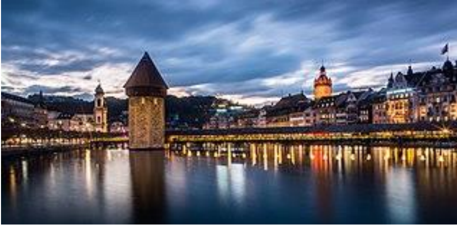
< Lucerne's Chapel Bridge

watches and traditional Swiss army knives, and perhaps visit the superb transportation museum . Late afternoon return to Weggis by lake steamer and dinner again in the hotel.