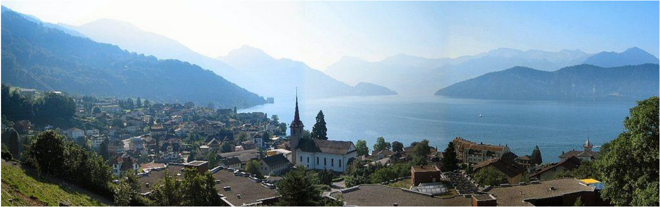
Weggis and Lake Lucerne

Pauwels Travel Bureau Ltd. 15 Egerton Street, Brantford, Ontario N3T 4L4 Tel: (519) 753-2695 - Fax: (519) 753-637 tours@pauwelstravel.com – www.pauwelstravel.com