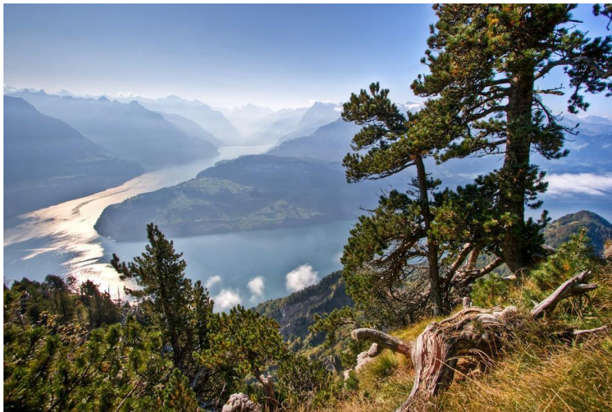
Lake Lucerne from the top of Mount Rigi

Day 4 – Friday, May 12: Day at leisure in Weggis. Your options include a walk along the shores of the lake, a relaxing tour of the lake by steamer, and a spectacular cable car ride to the top of legendary Mount Rigi , known as “the queen of the mountains,” a giant that rises spectacularly to an altitude of nearly 1,800 meters! Dinner again in the hotel.