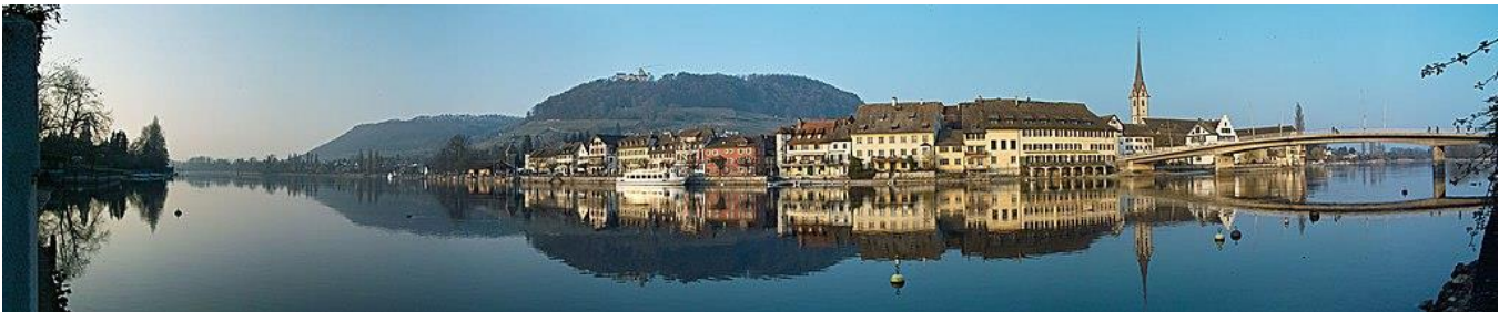
Stein am Rhein

Day 11 - Friday, May 19: Full-day excursion in the southern Black Forest and just across the Rhine and the Swiss border, with as highlights the Rhine Falls in the town of Schaffhausen, the most powerful waterfall in Europe, and the picture-perfect medieval town of Stein am Rhein . Dinner again in our hotel in Donaueschingen.