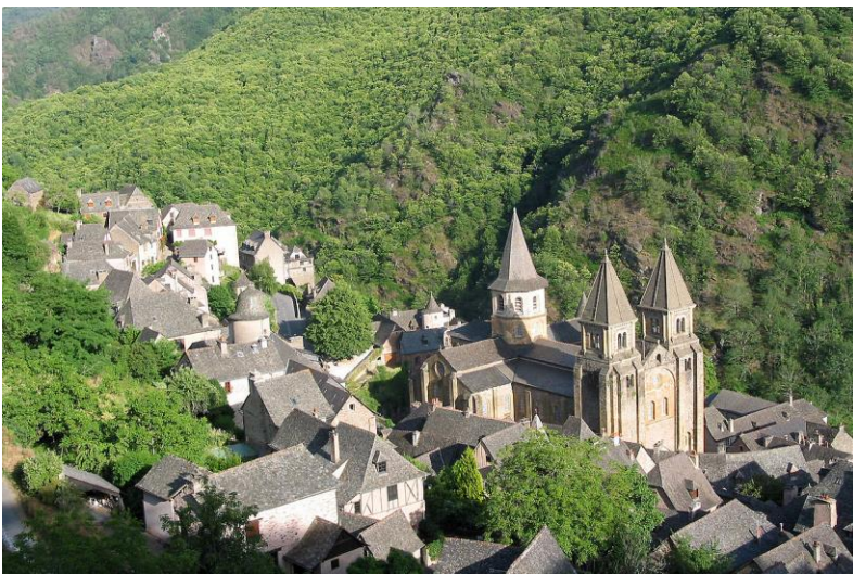
< Conques and its Romanesque abbey church

Day 10- Monday, October 25: This morning we tour the Lot river valley , with as highlight a visit to Saint-Cirq-Lapopie , perched on a rock overlooking tall white cliffs, a village that may claim to be one of the prettiest in all of France! Afternoon at leisure in Cahors. Dinner in the hotel.