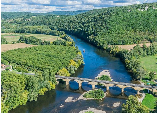
The Dordogne river valley

Day 8 - Saturday, October 23: Excursion into the wonderful neighbouring province of Périgord, the highlight being a visit to a UNESCO World Heritage Site, Lascaux, home of the world's most famous prehistoric cave paintings, estimated to be about 17,000 years old and mostly depicting large animals hunted by stone-age humans. Because the cave itself is not open to the public, we visit a high-quality, identical reproduction . We also tour the very scenic Périgord stretch of the Dordogne river valley, with pretty villages such as Beynac and Domme, and visit the gardens of the Château of Marqueyssac, with their amazing topiaries , as well as the very attractive old town of Sarlat-la-Canéda, bursting with shops selling local delicacies. Return to Cahors in late afternoon.