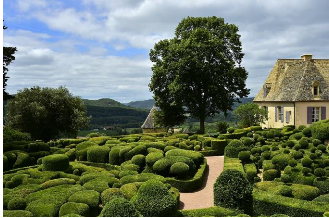
Chateau and gardens of Marqueyssac

Day 9 - Sunday, October 24: Excursion into the eastern, Quercy stretch of the Dordogne river valley, sprinkled with castles and pretty villages such as Souillac, La Treyne, Belcastel, Creysse, Carennac, and Castelnau; many pundits believe this region to be the most picturesque in all of France! We return to Cahors VIA a rugged Causse , a limestone “agro-pastoral cultural landscape” classified as a UNESCO site , via the towns of Gramat and Labastide-Murat, birthplace of Joachim Murat, one of Napoleon's generals and his brother-in-law.