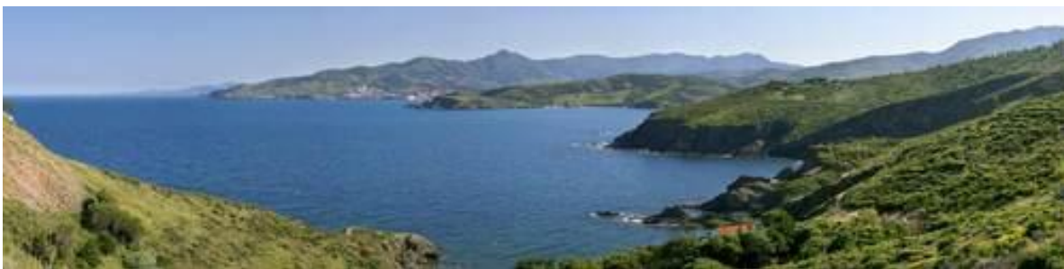
The Côte Vermeille or "Ruby Coast"

Day 14 - Friday, October 29: Morning walking tour of Perpignan's picturesque old town, followed by a leisurely exploration of the rugged but beautiful Côte Vermeille, or "Ruby Coast," similar to Spain's famous Costa Brava just south of the border, and dotted with resorts such as Argelès, a favourite haunt of painters such as Picasso and Matisse. Return to our hotel in mid-afternoon, and free time to relax before our final group dinner in a typical restaurant.