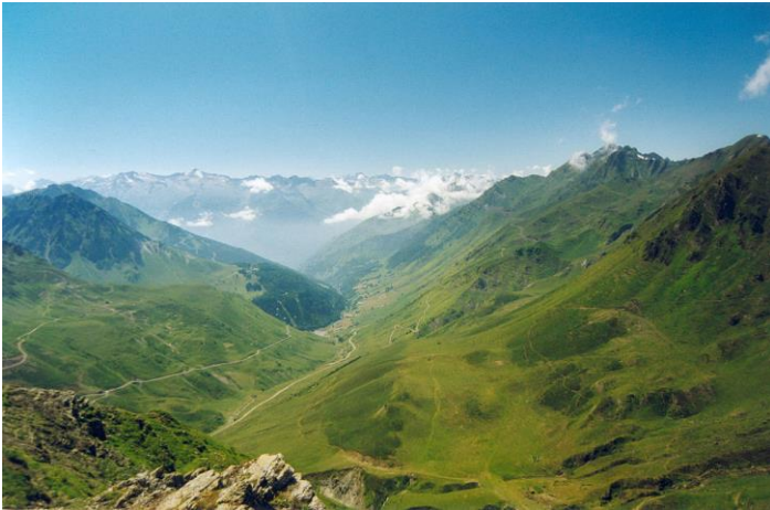
< View from the summit of the Tourmalet

Day 4 – Tuesday, October 19: Today, breathtaking mountain scenery awaits us as we motor via the town of Sort into the valley of the Noguera Pallresa, allegedly the most powerful river in the Pyrenees, and through a wild limestone gorge, the Congost de Collegats, to Pobla de Segur. We continue to Pont de Sert and, if time permits, take a sidetrip into the Boi Valley, famous for its Romanesque churches, collectively classified as a UNESCO World Heritage Site. On to the mountain resort of Vielha in the Aran Valley, for a mid-afternoon coffee break before crossing into France. Arrival in time for dinner in Bagnères de Luchon, an attractive spa situated in a valley surrounded by majestic Pyrenean mountain peaks! Ever since Roman times, the local hot water springs have served as a magnet to visitors, including celebrities such as Flaubert, Bismarck, and Matahari. Accommodation in the 3-star/superior-tourist class Hotel Panoramic, located on the main street, and dinner in the hotel .