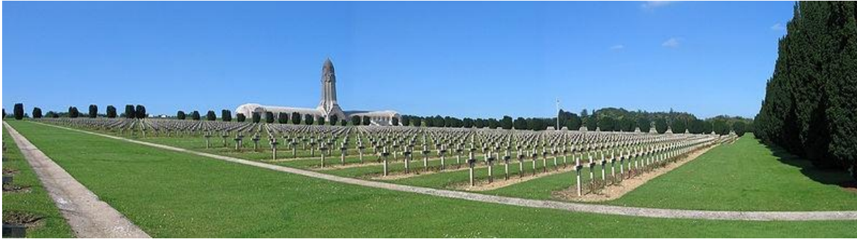
Douaumont Ossuary and Cemetery

Full-day excursion to Verdun , the quintessential French "killing field" of World War I. Our sightseeing program includes the infamous fort and the massive ossuary of Douaumont, the "Trench of the Bayonets", the old town of Verdun itself, and the Voie Sacrée ("Sacred Way"), the only road through which supplies could reach the besieged city during the terrible battle that was fought there in 1916 ( http://en.wikipedia.org/wiki/Battle_of_Verdun ). Return to Reims in the late afternoon and evening at leisure.