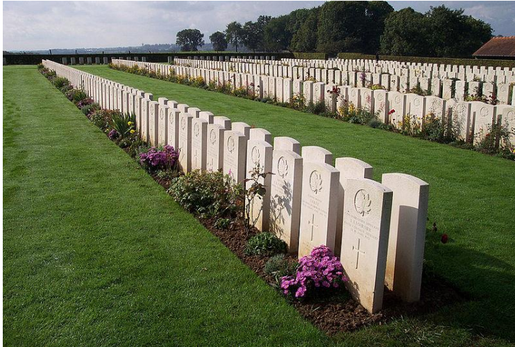
Dieppe Canadian War Cemetery

Pauwels Travel Bureau Ltd. 95 Dalhousie St., Brantford, Ontario, N3T 2J1 TEL: (519) 753 2695, FAX: (519) 753 6376 tours@pauwelstravel.com - www.pauwelstravel.com