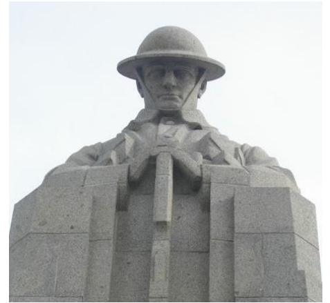
The Brooding Soldier >

This morning we enjoy a leisurely walking tour of old Bruges. Highlights include the Belfry, symbol of the city; the Church of Our Lady; the Gothic Town Hall; Medieval St. John's Hospital; the scenic canals that crisscross the town; the Lake of Love, and the romantic Beguinage. Remainder of the day at leisure. This evening, an optional dinner of Flemish culinary specialties during which we will be entertained by musicians specializing in medieval music but who will also treat us to songs of WW I!