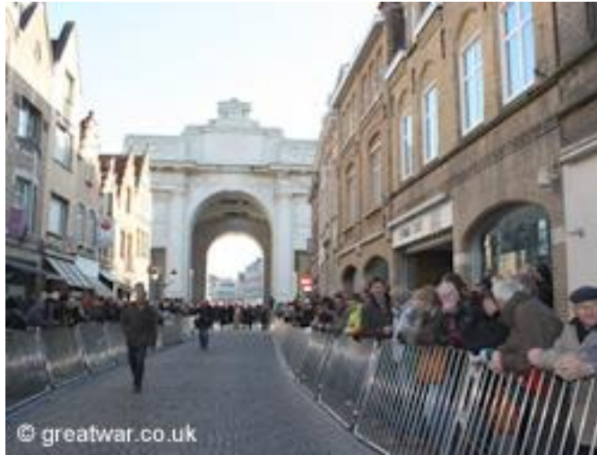
Approaching the Menin Gate in Ypres on Remembrance Day