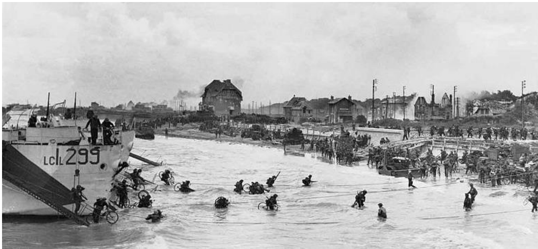
Canadian troops disembarking at Bernières, Juno Beach

Full-day tour of the Normandy Beaches that witnessed the landing of Allied troops on D-Day, June 6, 1944. Focus will be on the Canadian sector, Juno Beach , with the towns of Bernières and Courseulles , the Juno Beach Centre, Bény-sur-Mer Canadian War Cemetery, and Ardenne Abbey, where several Canadian POWs were executed by SS troops. Stops will also be included at the remains of the artificial Mulberry Harbour in Arromanches , the famous Pegasus Bridge , and the town of Caen . Return to Honfleur in late afternoon.