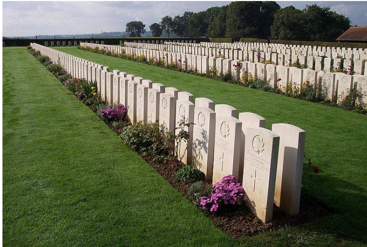
Dieppe Canadian War Cemetery

Pauwels Travel Bureau Ltd. 55 Dufferin Ave. Brantford, Ontario. N3T 4P6 TEL: (519) 753 2695, FAX: (519) 753 6376 tours@pauwelstravel.com - www.pauwelstravel.com