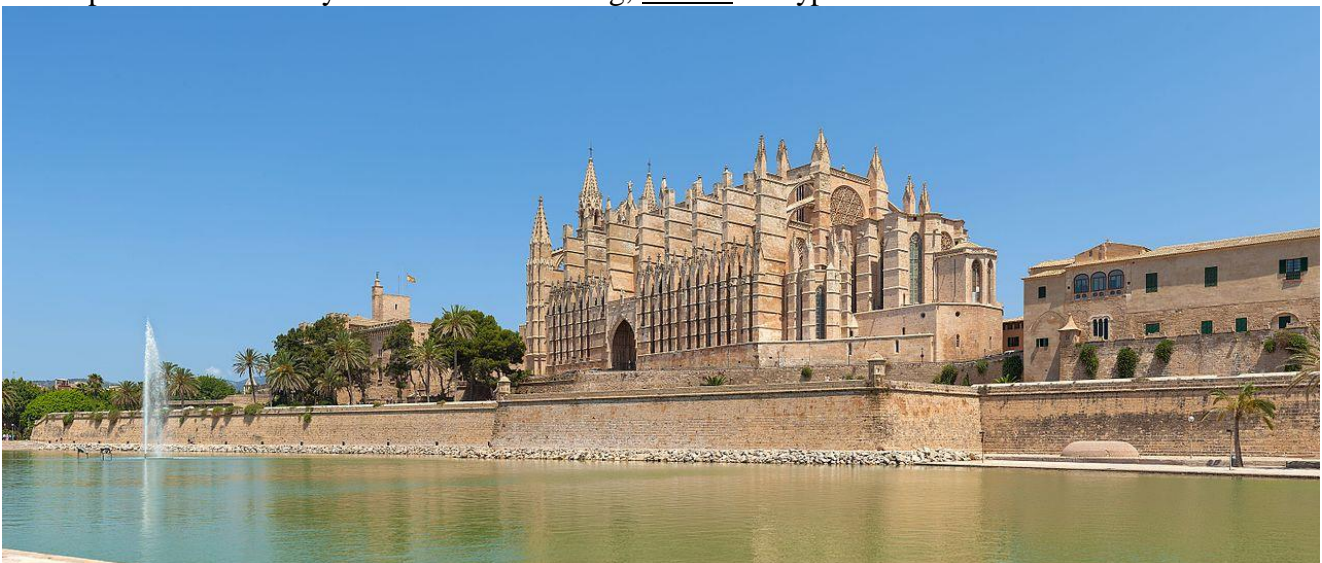
Palma’s waterfront and magnificent Cathedral

Day 3 - Tuesday, February 11: After our buffet breakfast, leisurely walking tour of Palma de Mallorca, a beautiful and vibrant city of approximately 400,000 inhabitants, and capital of the island of Mallorca and of the Balearic Community, one of Spain’s autonomous regions. We focus on the historical city centre, and among the highlights will be the magnificent Gothic Cathedral, Placa Major, San Francisco Church with its fine cloisters, the narrow streets of the Gothic Quarter, the wide Bom Boulevard, reminiscent of Barcelona’s Rambla, the seafront park (Parc de la Mar), and the harbour, bustling with sailboats and other pleasure craft. The afternoon is free to explore the town on your own. This evening, dinner in a typical restaurant!