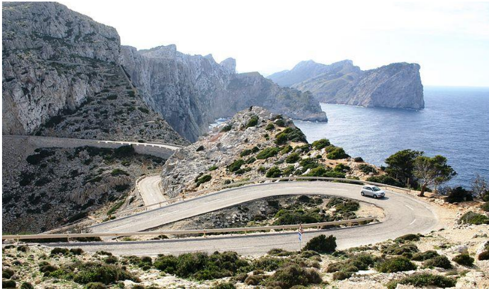
The road along Mallorca’s rugged western coast

Mallorca enjoys a mild and sunny Mediterranean climate, with lots of sunshine and very little rain. In February, the temperature (at sea level) oscillates between a cool 10-11° and balmy low twenties C, with a daily mean temperature of 18° C.