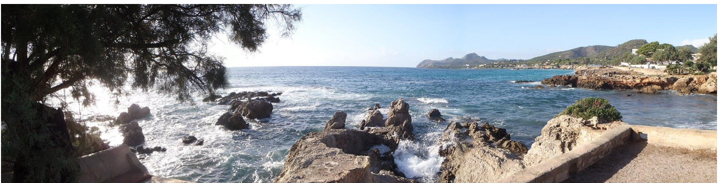
Coastal scenery near Cala Ratjada