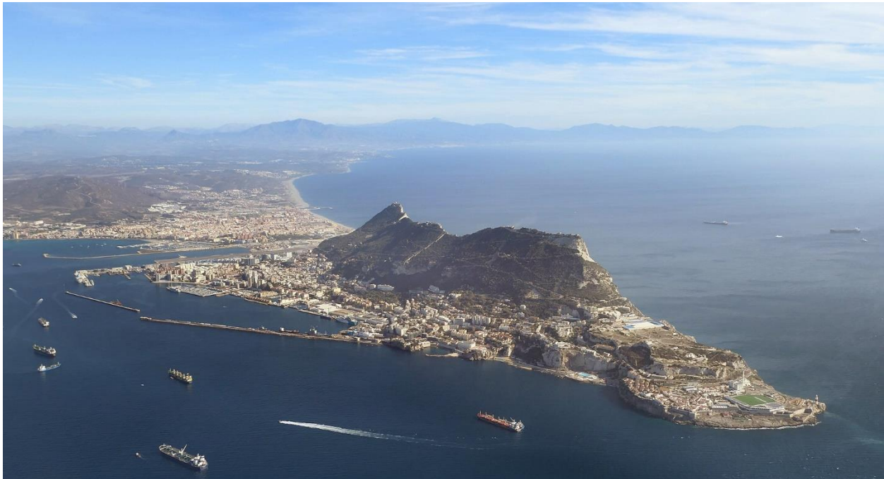
Gibraltar, with the Costa del Sol in the background

Pauwels Travel Bureau Ltd. 15 Egerton Street Brantford, Ontario N3T 4L4 Tel: 519-753-2695/1-800-380-3974- Fax: 519-753-6376 tours@pauwelstravel.com – www.pauwelstravel.com