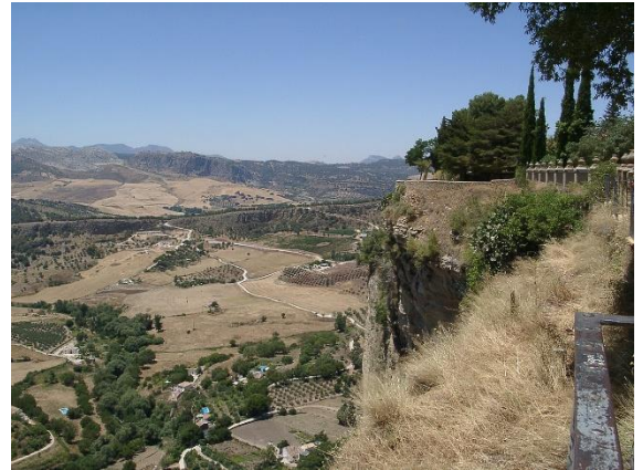
View of the countryside from the bridge

Day 7 – Tuesday, November 29: Full-day excursion to Malaga , an important Mediterranean seaport since the time of the Phoenicians and one of the major urban centres of Andalusia. The city also boasts beaches, superb architecture, fine museums, and excellent shopping, cuisine, and wine! Our tour includes the foremost historical sites, such as the Roman Theatre; the Cathedral; the two hilltop fortresses dating back to the time when the Moors (i.e. Arabs) ruled this land, the Alcazaba and the Gibralfaro, where one can enjoy a fabulous panoramic view of the city, the harbour, and the blue Mediterranean Sea. Another highlight will be our visit to the museum dedicated to the world-famous Spanish artist Pablo Picasso, who was born here. Free time for lunch and some shopping,