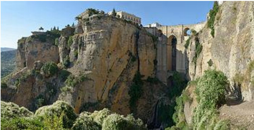
Spectacular Ronda, with the Puente Nuevo

Day 6 – Monday, November 28: Full-day excursion to the fascinating, romantic old town of Ronda , spectacularly perched on top of a big rocky hill cut in two by a 120 meter deep gorge; the two parts of the town are connected by an 18th-century stone bridge, the Puente Nuevo, offering breathtaking views of the surrounding countryside, the scenic Serranía de Ronda, reputed to be one of the most beautiful areas of Andalusia. Ronda was settled by Phoenicians, Romans, Visigoths, and Arabs, and was one of the last outposts of Islamic rule in Andalusia. The town is also considered to be the cradle of bullfighting and boasts the oldest bullring in Spain, built in 1785. Our local tour will focus on these sites and monuments as well as the well-preserved medieval Arab baths; the Church of Santa María Mayor, a former mosque; and Mondragón Palace, an architectural pastiche of Islamic, Gothic and Renaissance styles, with a beautiful garden. Time permitting, on the return to Torremolinos in the afternoon, we may briefly visit Setenil de las Bodegas , a village nestled under a huge rock towering over a narrow river gorge.