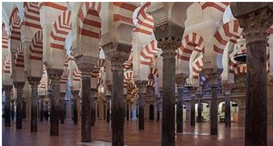
< Interior of the Mosque in Cordoba

Day 2 – Thursday, November 24: After breakfast, sightseeing in Cordoba , a UNESCO World Heritage Site, with as absolute highlight our visit to the 1,000-year old Mosque, a marvel of Islamic architecture. In the afternoon we motor to Torremolinos, hub of Spain’s famous Mediterranean playground, the Costa del Sol. Check into one of the resort’s top hotels, the first-class/four-star Melia Costa del Sol , centrally located and overlooking the beach. During our entire stay in this great property, a buffet-style breakfast and dinner will be offered daily; with dinner, beverages will be included as follows, per person: mineral water plus ¼ liter of wine or 1 soft drink or 1 beer.