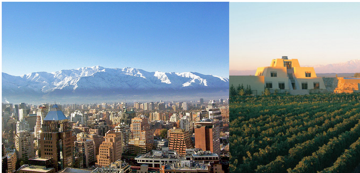
Santiago; Catena Zapata, Mendoza

Over the next two days, we will have the chance to explore the excitement of Santiago, including its markets, history and restaurants. In Santiago – home to over six million people - ancient traditions coexist with 21st century life in each neighborhood. We will have some guided explorations, and free time to explore on your own. We also plan to visit with a winery known by Tony near Santiago, and will cap it off with a wonderful dinner at one of the top restaurants in Latin America!