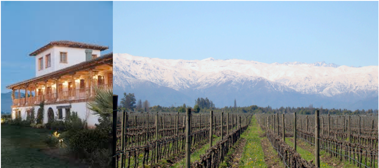
Mont Gras Winery at dusk; Maipo Valley Vineyards

Over the next two days, we will explore the wine, food and culture around the historic city of Santa Cruz and the Colchagua Valley. We will have visits and tastings with a range of producers, with special visits curated by Tony. Our tour includes visits to the exceptional wineries of Montes, Mont Gras, and Lapostolle Clos Apalta, all known for their excellent wines. We also plan to visit the Colchagua Museum, with its impressive archeological collection and pavilions on Chilean history one day.