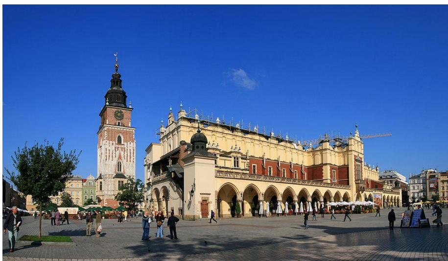
< Krakow's magnificent main square

Day 5 - Saturday, August 21: After a leisurely breakfast, comprehensive sightseeing tour of Krakow, one of Europe's most beautiful and interesting old cities, with all the great sights, especially Wawel Royal Palace, Rynek Główny, Europe's largest medieval market square, the medieval Cloth Hall, the Church of Our Lady, the Gothic buildings of the Jagellonian University, the statue of Copernicus, picturesque streets such as Ulica Kłonicza, the superb Gothic Cathedral, and the Jewish Kazimierz District with the Temple Synagogue, Corpus Christi Church and Ulica Szeroka. Old Krakow is a UNESCO World Heritage Site ( https://whc.unesco.org/en/list/29 ). The rest of the day is free to explore this wonderful city on your own. A classical music concert or folklore show may be available this evening on an optional basis.