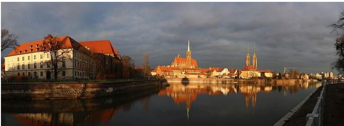
Wroclaw, “Polish Venice”, on the banks of the Oder River

Day 12 - Saturday, August 28: Morning sightseeing tour of Wroclaw, with focus on the very attractive old town, known as “Polish Venice” because of its scenic location of a number of arms of the Oder River, featuring an impressive main square, an exuberant city hall, a baroque university building, and the usual array of fine palaces and churches. We also visit the city's UNESCO World Heritage Site, Centennial Hall, a pioneering work of modern engineering and architecture, created in 1911-1913 by the architect Max Berg ( https://whc.unesco.org/en/list/1165 ). No group dinner this evening.