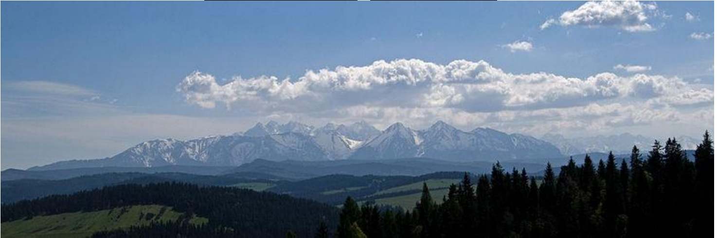
The Tatras, highest peaks of the Carpathian Mountain Range, in the vicinity of Zakopane, Poland