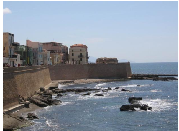
The walls of Old Alghero >

Day 9 – Thursday, May 19: A relaxing day in Alghero. In the morning we visit the walled old town, known as Sardinia's "Little Barcelona" on account of the Catalan influence. Afterwards, free time for shopping, exploring Old Alghero on your own, or relaxing around the pool of the hotel or on the beach. Weather permitting, an optional boat tour may be offered to the famous Grotta di Nettuno, the Sardinian version of Capri's Blue Grotto. Dinner again in the restaurant of our hotel.