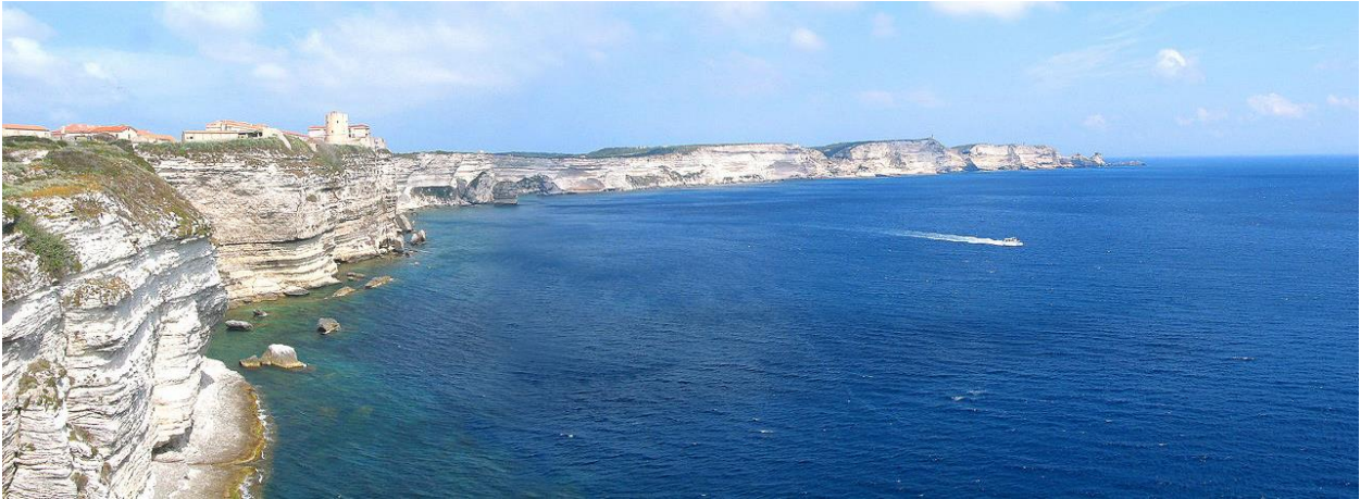
The Corsican town of Bonifacio, situated on cliffs overlooking the Mediterranean and Sardinia

Pauwels Travel Bureau Ltd. 55 Dufferin Avenue, Brantford, Ontario N3T 4P6 Tel: (519) 753-2695/1-800-380-3974 - Fax: (519) 753-6376 tours@pauwelstravel.com – www.pauwelstravel.com