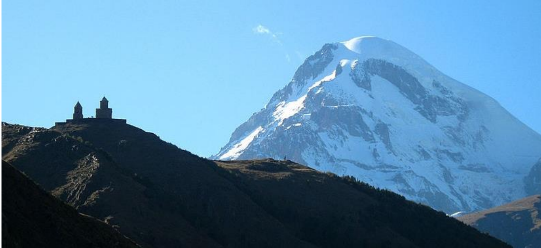
The Church of the Holy Trinity and Mount Kazbegi in Georgia's High Caucasus

Pauwels Travel Bureau Ltd. 95 Dalhousie Street, Brantford, Ontario N3T 2J1 Tel: 519-756-4900/ 519-753-2695 - Fax: 519-753-6376 tours@pauwelstravel.com - www.pauwelstravel.com