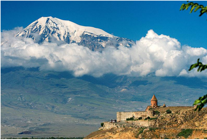
< Khor Virap Monastery and Mount Ararat

Day 13 - Tuesday, September 18: (L+D) After breakfast we drive to Khor Virap Monastery, an important pilgrimage site for Armenians situated in the south of Armenia and within view of magnificent, snow-capped Mount Ararat (5,165m), looming just across the border in Turkey. On through the Ararat Plain, the country's agricultural heartland, full of vineyards and apricot orchards, to the Monastery of Noravank, an architectural gem nestled among cliffs overlooking a deep gorge. Group lunch, then on to the village of Areni, in; it was here that viticulture