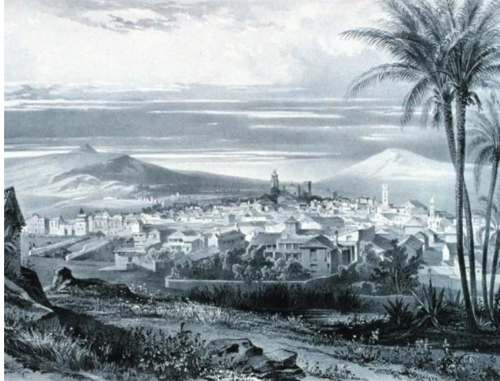
The town of La Laguna on Tenerife in 1880

Pauwels Travel Bureau 55 Dufferin Ave, Brantford, Ontario N3T 4P6 Tel. 519-756-4900 / 519-753-2695 - Fax 519-753-6376 tours@pauwelstravel.com - www.pauwelstravel.com