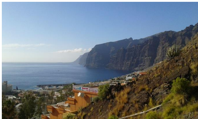
< Los Gigantes

Day 4 - Sunday, January 20: Full-day circle tour of Tenerife, the largest of the seven Canary Islands, featuring a very green northern part (with countless banana plantations) and an arid southern zone, separated by Teide, a huge volcano. Our itinerary will include the quaint town of Icod de Los Vinos , famous for its particularly impressive (and very old) specimen of the dragon tree, the only survivor of the archipelago’s original flora; the Castillo de San Miguel in Garachico ; the resort of Los Gigantes , whose name refers to enormous black cliffs with a vertical drop of over 400 meters; and Candelaria , a famous centre of pilgrimage devoted to the Virgin Mary. Return to the hotel in time for dinner.