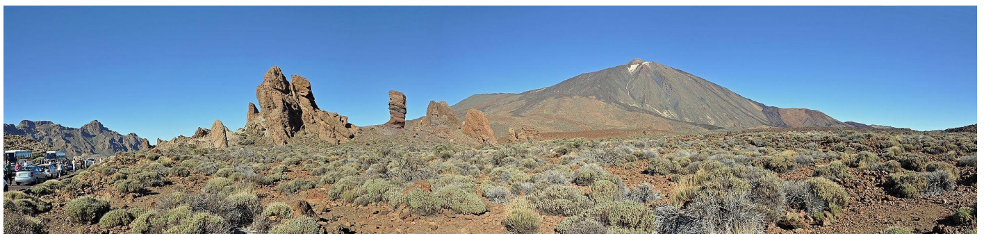
Volcanic landscape in Teide National Park

Day 9 - Friday, January 25: Morning excursion to Teide National Park , the most visited National Park in the Canary Islands and Spain; with around 3 million visitors annually, it is second only to Mt. Fuji in Japan! Teide was a sacred mountain to the aboriginal inhabitants of the Canary Islands, like Mt Olympus was to the ancient Greeks. (For more information, see http://en.wikipedia.org/wiki/Teide )