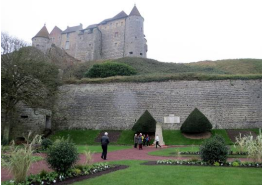
< Members of a Pauwels Travel group at the Canadian Memorial in Dieppe in 2015

Day 9 - Wednesday, April 12: Departure from Honfleur after breakfast. We cross the Seine Estuary near Le Havre via the amazing Normandie Bridge ( https://en.wikipedia.org/wiki/Pont_de_Normandie ) and motor to the seaport of Dieppe, scene of Operation Jubilee, a controversial Allied raid against the German Atlantic Wall in 1942, where many Canadian lives were lost. Visit to the landing beach, the Canadian Memorial, and the Canadian War Cemetery. On to Boulogne and the nearby village of Wimereux to pause at the tomb of John McCrae ( www.webmatters.net/cwgc/wimereux.com.htm ). A little further, in Audinghen, a village on Cape Gris Nez, we stop to see the big German guns used to shell Dover, visible (on a clear day) on the other side of the narrowest stretch of the English Channel! Then we continue via the coastal highway to Calais and Dunkirk, the Belgian border, and Bruges, arguably the best preserved medieval town in all of Europe. We enter the city via Canada Bridge, so named because it was also used by the Canadian troops (Manitoba Dragoons) when they liberated this city in early September 1944. Dinner and overnight in the centrally located 3-star Hotel Zand ( http://www.portinari.be/EN/HM ).