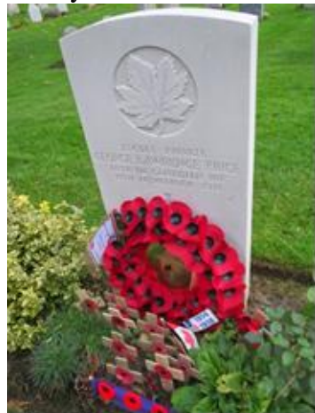
< Grave of G. L. Price, last Canadian killed in the Great War

For more pictures of Pauwels Travel’s 2014 battlefield tour, see: https://plus.google.com/photos/112007961211927448869/albums/6081916973145443425?banner=pwa