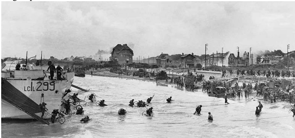
Canadian troops disembarking at Bernières, Juno Beach

Day 8 - Tuesday, April 11: Today we tour the Normandy Beaches that witnessed the landing of Allied troops on D-Day, June 6, 1944. We focus on the Canadian sector, Juno Beach, where we visit the towns of Bernières and Courseulles, the Juno Beach Centre, and Bény-sur-Mer Canadian War Cemetery, and Ardenne Abbey, where SS troops executed a number of Canadian POWs. Stops will also be included at the remains of the artificial Mulberry Harbour in Arromanches, the famous Pegasus Bridge, and the town of Caen. Return to Honfleur in late afternoon and free evening. No group dinner.