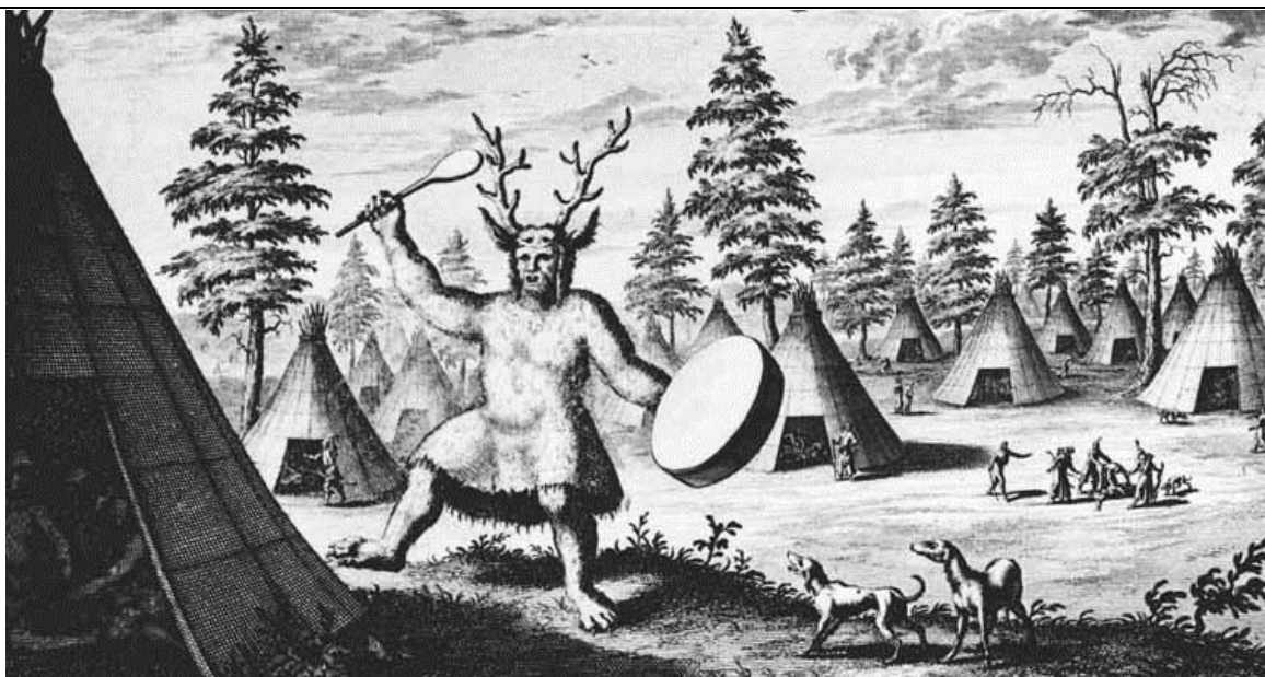
17 th -century illustration of a Siberian shaman

Day 11 – Monday, August 28: This morning we motor back to Ulan-Ude, where today’s program will focus on the famous shamanistic traditions of Siberia in general and Buryatia in particular. The absolute highlight will be a session with shamans, involving dances, libations, animal sound mimesis, conversations with spirits, removal of curses, etc. ( https://en.wikipedia.org/wiki/Shamanism_in_Siberia and https://www.youtube.com/watch?v=-JPKkV8cCf0 ) Dinner and overnight in the 3-star Hotel Odon ( https://www.lonelyplanet.com/russia/ulan-ude/hotels/odon-hotel/a/lod/273ead66-8484-496a-a952-9f612a60eb58/360534 )