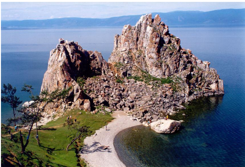
< Scenery along the shores of Lake Baikal

Lake Baikal is the oldest (25 million years) and deepest (1,700 m) lake in the world, and is featured on UNESCO's list of natural World Heritage Sites ( http://whc.unesco.org/en/list/754 ) The 3.15-million-ha lake contains 20% of the world's unfrozen freshwater reserve. (For more information on the region, see http://waytorussia.net/Baikal/Destinations/Buryatia.html )