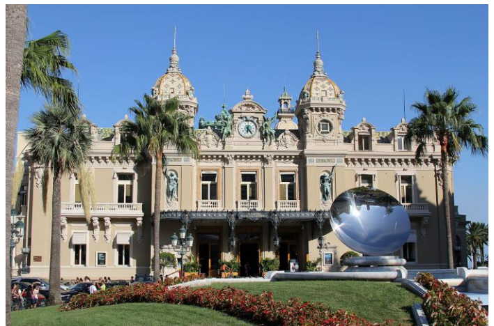
The Monte Carlo Casino