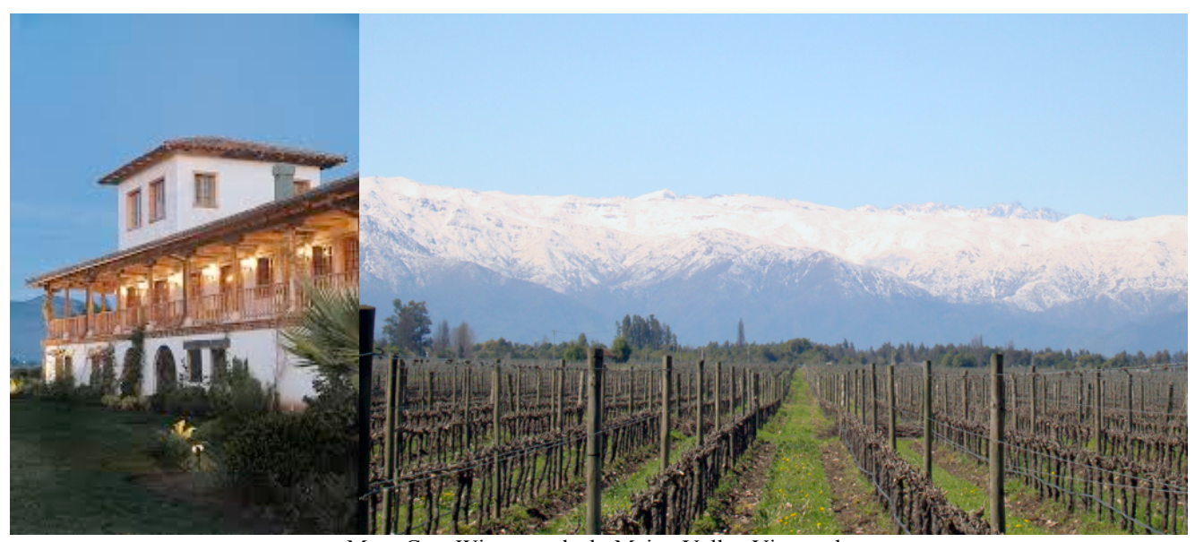
Mont Gras Winery at dusk; Maipo Valley Vineyards

Over the next two days, we will explore the wine, food and culture around the historic city of Santa Cruz and the Colchagua Valley. We will have visits and tastings with a range of producers, with special visits curated by Tony. Our tour includes visits to the exceptional wineries of Montes, Mont Gras, and Lapostelle Clos Apalta, all known for their excellent wines. We also plan to visit the Colchagua Museum, with its impressive archeological collection and pavilions on Chilean history one day.