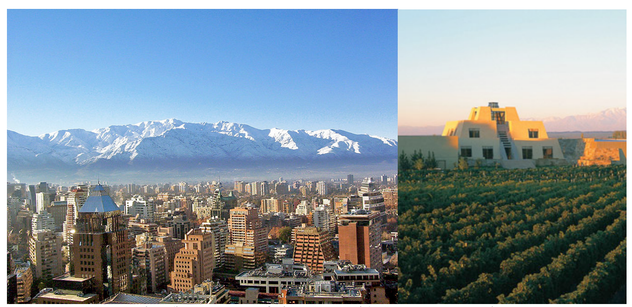
Santiago; Catena Zapata, Mendoza

Over the next two days, we will have the chance to explore the excitement of Santiago, including its markets, history and restaurants. In Santiago – home to over six million people - ancient traditions coexist with 21st century life in each neighborhood. We will have some guided explorations, and free time to explore on your own. We also plan to visit with a winery known by Tony near Santiago, and will cap it off with a wonderful dinner at one of the top restaurants in Latin America!