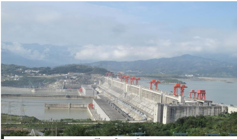
Three Gorges Dam

Day 6 – Sunday, April 22: Three Gorges (B/L/D)