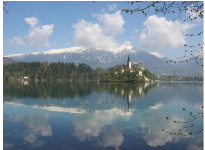
Fabulous Lake Bled, surrounded by Alpine peaks

Day 12 - Saturday, April 28: Morning sightseeing tour of nearby with focus on the attractive old town; highlights will include the major squares with their fountains, statues, and imposing buildings such as city hall and the Slovenian Parliament, Triple Bridge and Dragon Bridge, the Open Market, and Ljubljana Castle, high on a hill with superb views of the city. Then we take a sidetrip to nearby Bled , an exquisite resort in the Alps, nestled on the shores of a lake surrounded by towering mountain peaks. After our visit and a boat tour on the lake, we return to Ljubljana. Today, group lunch OR dinner featuring Slovenian specialties in a typical restaurant.