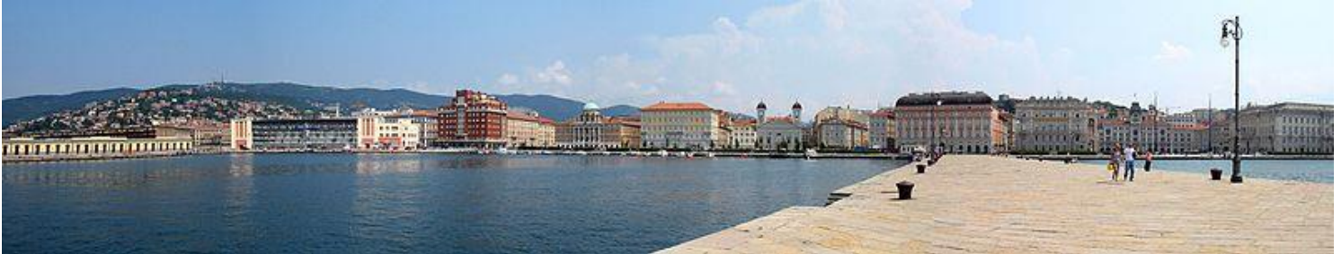
Trieste's glorious waterfront

Day 10 - Thursday, April 26: Sidetrip to the archaeological area and the Patriarchal Basilica of Aquileia , terminus of Antiquity's Amber Road, linking the Adriatic, and the Mediterranean Sea in general, to the Baltic Sea, one of the largest and wealthiest cities of the Roman Empire, destroyed by Attila in the 5th century, another UNESCO site ( http://whc.unesco.org/en/list/825 ). We also visit Udine , the charming capital of Italy's Friuli Province, before returning to Trieste in late afternoon via an area where many battles were fought between Italian and Austrian troops in WW I. No group dinner this evening.