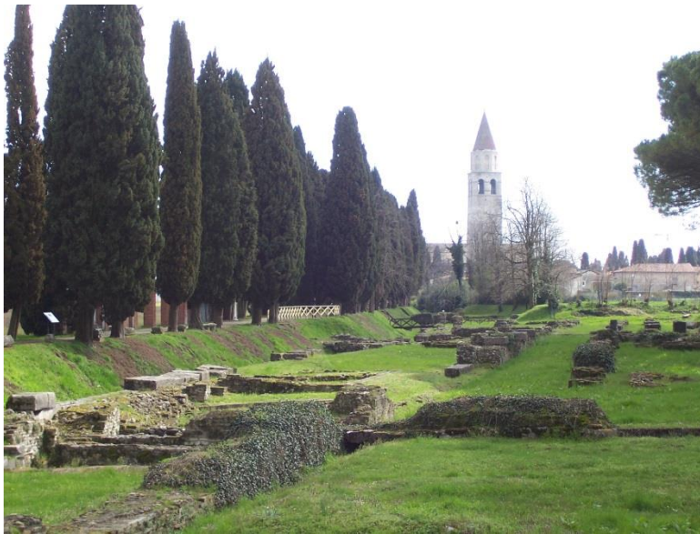
Archaeological site of Aquileia