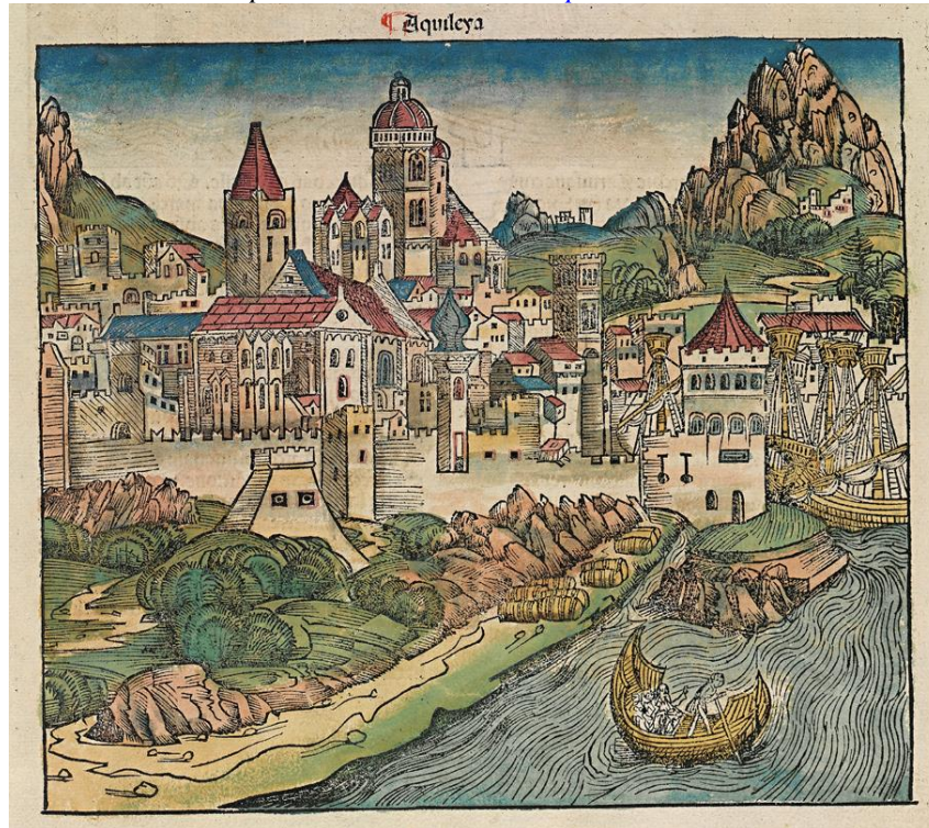
Aquileia, the Roman Empire's metropolis on the Adriatic, on a 1493 German woodcut

Pauwels Travel Bureau Ltd. 95 Dalhousie Street, Brantford, Ontario N3T 2J1 Tel: 519-753-2695/519-756-4900 - Fax: 519-753-6376 tours@pauwelstravel.com – www.pauwelstravel.com