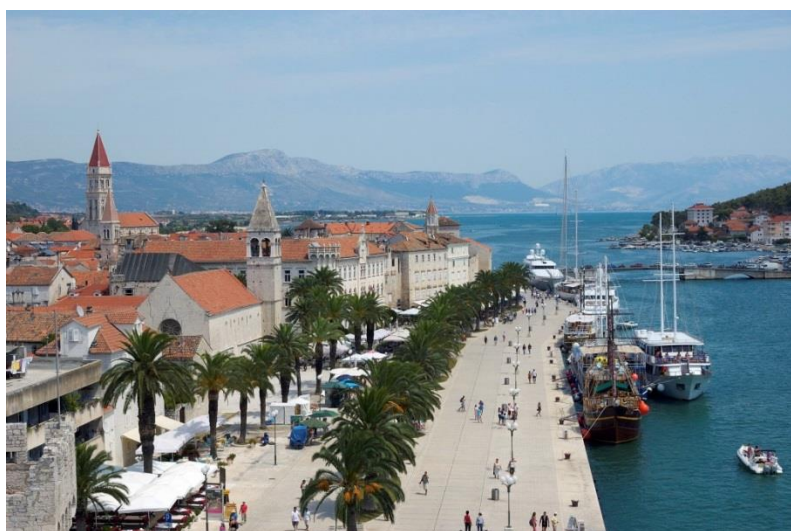
The old town of Trogir

Day 4 - Friday, April 20: Today we motor for a total distance of about 200km through Croatia's rugged interior, stretching along the Bosnian border, via towns such as Gracac and Knin, to the beautiful Dalmatian Coast. Our destination is picturesque Sibenik , the oldest Croatian town on the Adriatic Sea, ruled for many centuries by outsiders such as the Venetians and the Austro-Hungarians. Dinner and overnight in a 4-star beachfront hotel a few miles away from the city centre, the Amadria Park Hotel Jure ( www.solarishotelsresort.com/wh/hotel-jure-en ).