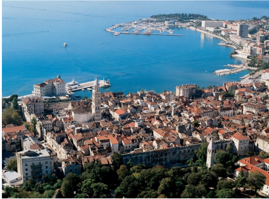
Split in Dalmatia, jewel of Croatia's Adriatic coast

Day 6 - Sunday, April 22: Full-day excursion to two nearby UNESCO World Heritage Sites. First, Trogir , a quaint coastal community with ancient Greek origins and plenty of medieval, Renaissance, and baroque buildings ( http://whc.unesco.org/en/list/810 ). Second, the ancient city of Split , with its magnificent seafront and ruins of the palace of Roman Emperor Diocletian, built around 300AD ( http://whc.unesco.org/en/list/97 ). Return to Sibenik - along the scenic coastal road . . . if time permits! - and dinner in the hotel.