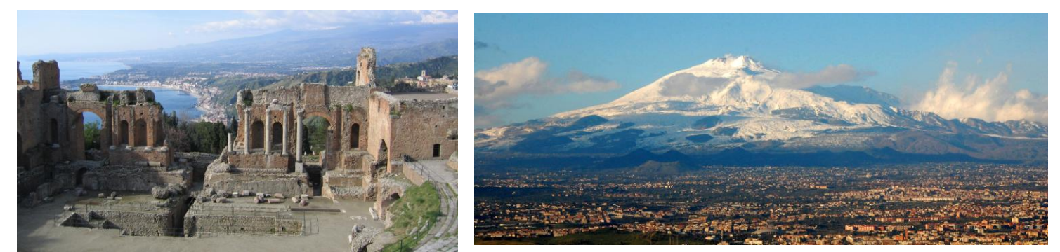
Greco-Roman Theatre of Taormina

<u>Day 3 - Saturday, November 16</u>: After breakfast, we visit Taormina's major historical monument, the superb hilltop Greco-Roman theatre, with spectacular views of Mt Etna and the coast. The we explore the picturesque old town itself, featuring remains of Roman and Byzantine monuments, such as the Naumachia, a Roman cistern, the medieval Duomo (Cathedral), churches, castles, palaces; and let's not forget the fine shops and lively cafés along Corso Umberto, the vibrant pedestrian main street, a former Roman road, which bisects the centre of the town between the two ancient city gates, Porta Messina and Porta Catania, via the charming Piazza Piazza IX Aprile, the town's main square, dominated by the Clock Tower or Porta di Mezzo. The afternoon is free to explore beautiful Taormina on your own. Dinner again in the hotel.