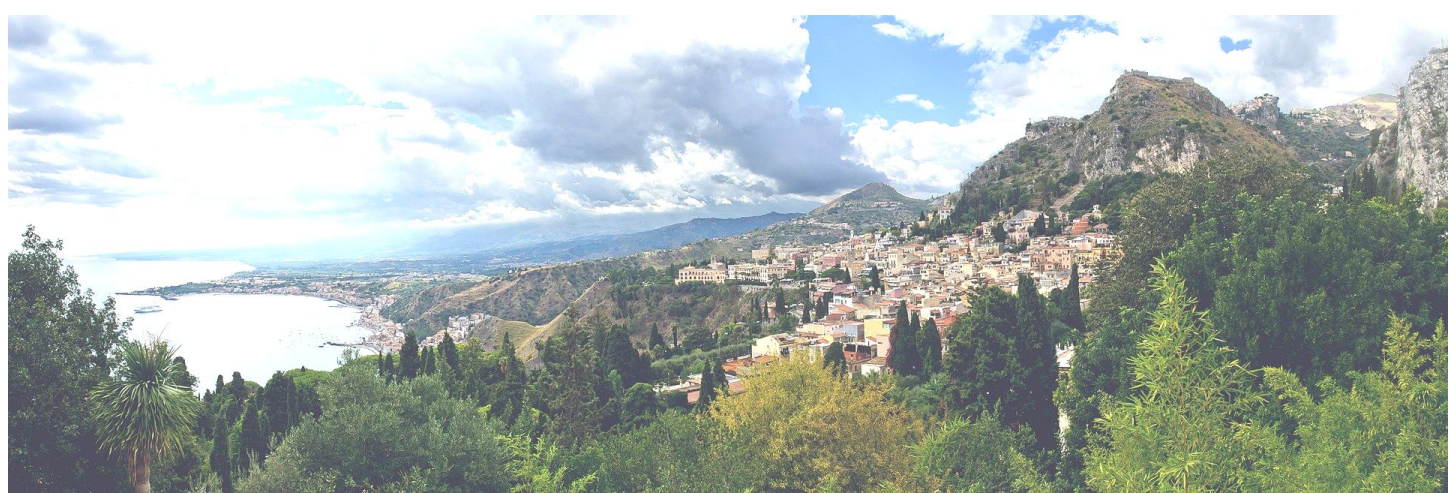
Taormina, the Ionian Sea, and Mount Etna

PAUWELS TRAVEL BUREAU LTD. 55 Dufferin Avenue, Brantford, Ont. N3T 4P6 Tel. 519 756-4900/519-753-2695 - Fax 519 753-6376 www.pauwelstravel.com - tours@pauwelstravel.com