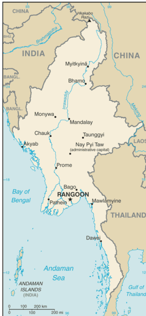
Map of Myanmar (from CIA World Factbook, c/o Wikimedia Commons)

The following vaccinations are not compulsory, but recommended . It is advised to consult your doctor about their desirability: Hepatitis A and B – Typhoid - Japanese Encephalitis – Rabies - Yellow Fever - Malaria