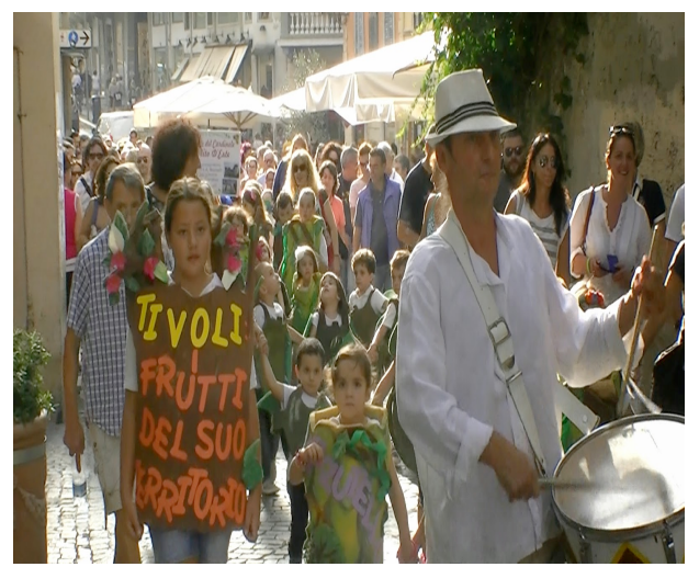
Sagra del Pizzutello-Grape Festival in Tivoli