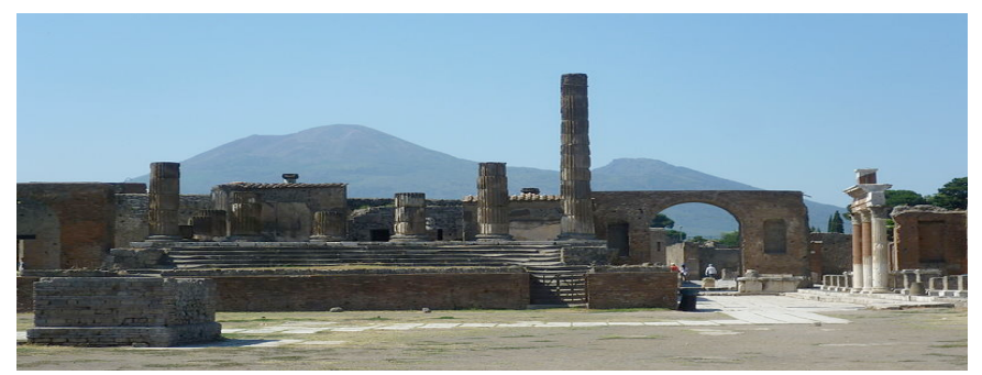
Ruins in Pompeii

Early morning departure for Pompeii, here we will visit the lost city that was destroyed by volcanic ash, and pumice due to the eruption of Mount Vesuvius in 79 AD. Today the well preserved ruins are one of the world's most fascinating archaeological sites to see. Following the tour, we will enjoy a traditional Napolese pizza lunch, before driving on to Naples. Upon arriving we will visit the National Archeological Museum, where you will see many preserved items from the Pompeii ruins, and if time permitting a panoramic tour of Naples before making our way back to Rome in the late evening.