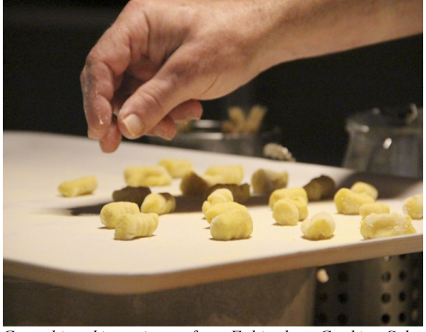
Gnocchi making