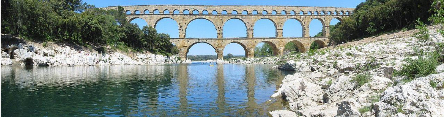
The Pont du Gard

monuments, in this case a fine triumphal arch as well as what is possibly the best preserved of the handful of Roman theatres that still exist. In the afternoon we briefly stop in the village of Chateauneuf-du-Pape to taste the world famous, high-quality wine, and before arriving back in Nimes we visit the Pont du Gard, an amazing Roman aquaduct, another UNESCO World Heritage Site, situated in the middle of a wonderful Provençal landscape.