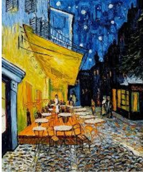
Vincent van Gogh's 'Café Terrace at Nights'

Pauwels Travel Bureau Ltd. 95 Dalhousie Street, Brantford, Ontario N3T 2J1, Canada Tel: 519-756-4900 / 519-753-2695 - Fax: 519-753-6376 tours@pauwelstravel.com – www.pauwelstravel.com