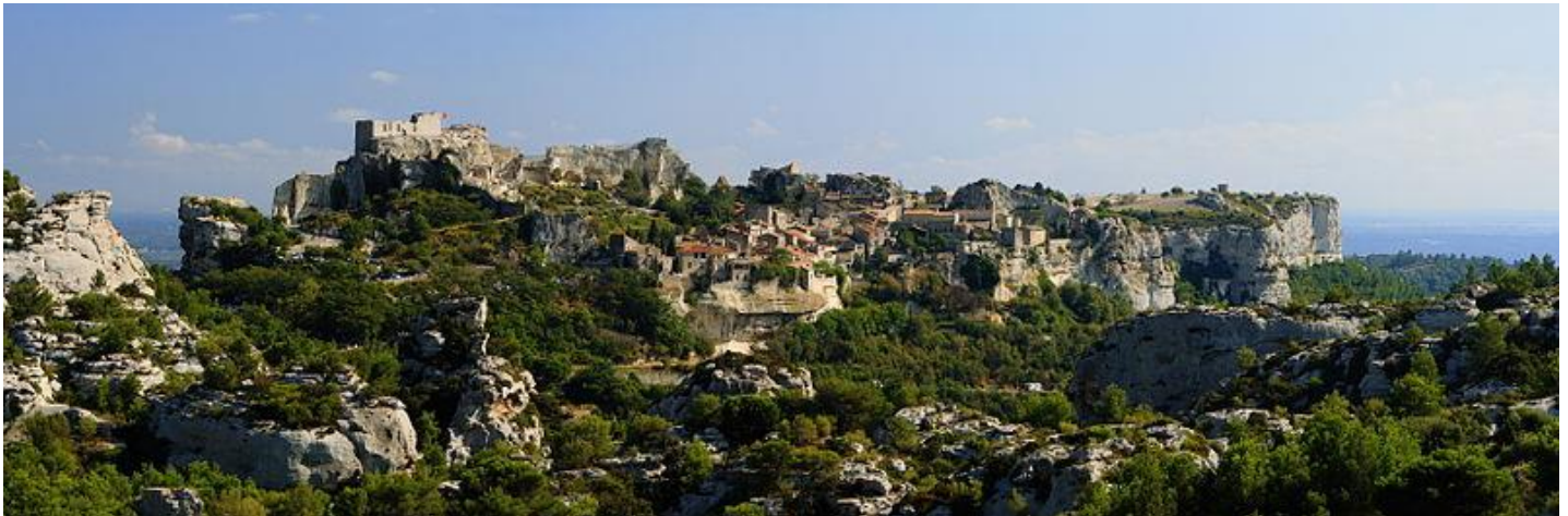
The medieval ghost town of Les Baux