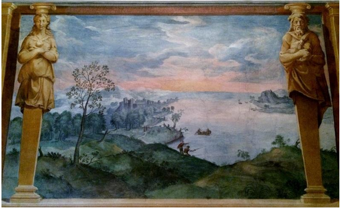
Mythological landscape of mountains and sea in the Villa d'Este in Tivoli

Pauwels Travel Bureau Ltd. 95 Dalhousie Street, Brantford, Ontario N3T 2J1 Tel: 519-753-2695/519-756-4900 - Fax: 519-753-6376 tours@pauwelstravel.com – www.pauwelstravel.com