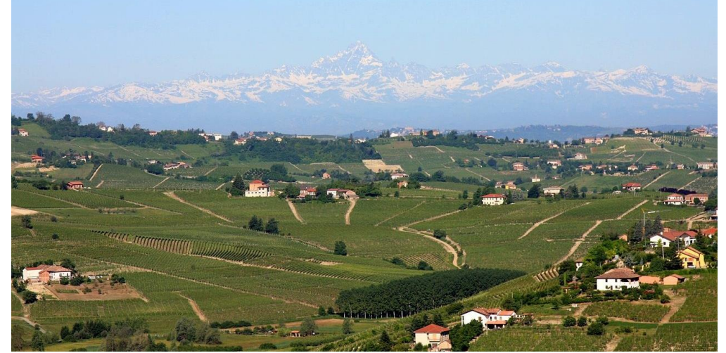
The Piedmont wine country, with the Alps in the background

<u>Day 4 - Sunday, March 26</u>: Morning visit to Turin's Egyptian Museum, described as "one of the richest collections of Egyptian antiquities in the world" ( www.museoegizio.it/en ). The rest of the day is free to shop, explore the city on your own, or visit yet another museum, perhaps the Gallery of Modern and Contemporary Art ( http://www.gamtorino.it/en ) or the fabulous Automobile Museum ( www.museoauto.it/website/en ). No group dinner; this evening it may be possible to attend a classical music concert (optional).