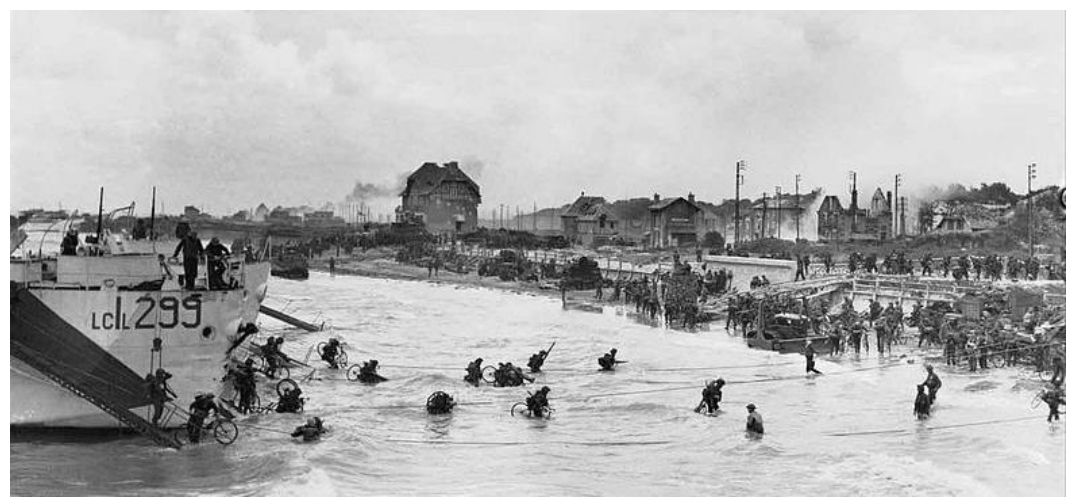
Canadian troops disembarking at Bernières, Juno Beach

Full-day tour of the Normandy Beaches that witnessed the landing of Allied troops on D-Day, June 6, 1944. Focus will be on the Canadian sector, Juno Beach , with the towns of Bernières and Courseulles , the Juno Beach Centre, Bény-sur-Mer Canadian War Cemetery, and Ardenne Abbey, where several Canadian POWs were executed by SS troops. Stops will also be included at the remains of the artificial Mulberry Harbour in Arromanches , the famous Pegasus Bridge , and the town of Caen . Return to Honfleur in late afternoon.