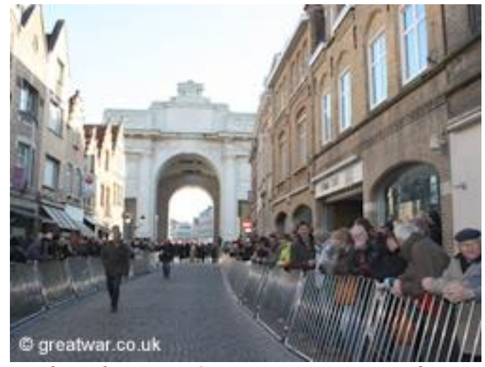
Approaching the Menin Gate in Ypres on Remembrance Day