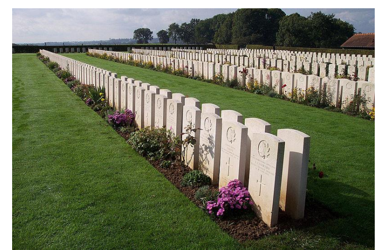
Dieppe Canadian War Cemetery

Pauwels Travel Bureau Ltd. 95 Dalhousie St., Brantford, Ontario, N3T 2J1 TEL: (519) 753 2695, FAX: (519) 753 6376 tours@pauwelstravel.com - www.pauwelstravel.com