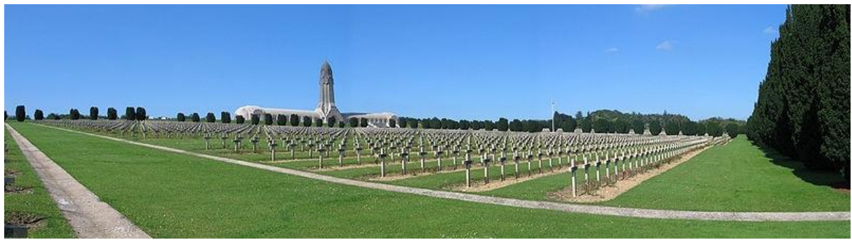
Douaumont Ossuary and Cemetery

Full-day excursion to Verdun , the quintessential French "killing field" of World War I. Our sightseeing program includes the infamous fort and the massive ossuary of Douaumont, the "Trench of the Bayonets", the old town of Verdun itself, and the Voie Sacrée ("Sacred Way"), the only road through which supplies could reach the besieged city during the terrible battle that was fought there in 1916 ( http://en.wikipedia.org/wiki/Battle_of_Verdun ). Return to Reims in the late afternoon and evening at leisure.