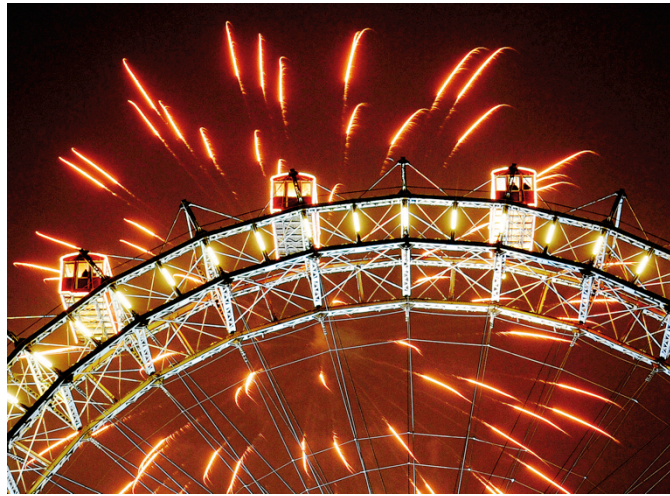
Vienna's Giant Ferris Wheel