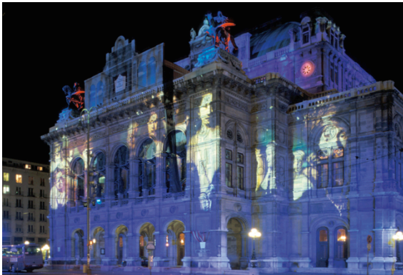
<Vienna State Opera

After breakfast at the hotel you will have a full day at leisure for individual sightseeing or relaxation. Lunch will be on your own. In the Evening enjoy a performance of Johann Strauss's operetta " Die Fledermaus " ( the Bat ) at the Vienna State Opera (tickets in first category provided). Cast to be determined. In "The Bat" the Waltz King created a masterpiece in the genre of operetta that has never been transcended since. It features brilliant music combined with a bitingly comic plot. Dinner on your own. Overnight in Vienna (4).