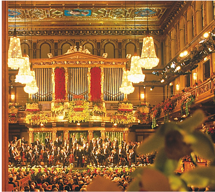
New Year's Concert of the Vienna Philharmonic Orchestra in the Golden Hall of the Musikverein

Pauwels Travel Bureau Ltd. 95 Dalhousie Street, Brantford, Ontario N3T 2J1 Tel: (519) 756-4900/519-753-2695 Fax: (519) 753-6376 E-mail: tours@pauwelstravel.com - www.pauwelstravel.com