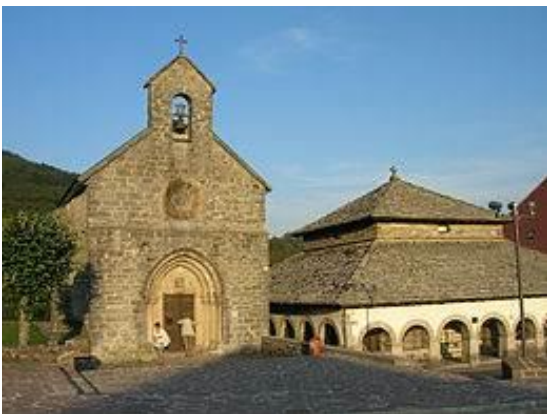
< Monuments in Roncevaux

Departure from Albi after breakfast. We motor to St. Jean-Pied-de-Port , the picturesque village at the foot of the Pyrenees Mountains where three roads to Compostela converged. After our lunch break, we follow the footsteps of the pilgrims to the top (at a modest altitude of 1057m) of the mountain pass of Roncevaux (or Roncesvalles), where Charlemagne's legendary paladin, the brave knight Roland, died heroically in a battle against the Saracens. Visit to the monastery church, burial place of the monarchs of Navarra, a medieval kingdom that is now a province of Spain. On to Navarra's capital, Pamplona , home of the world-famous annual "running of the bulls" described by Hemingway, for overnight in the centrally-located first-class Hotel Tres Reyes ( www.hotel3reyes.com/web ). Dinner in the hotel or in a nearby restaurant.