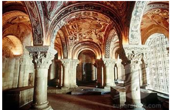
San Isidoro, "Sistine Chapel" of Romanesque painting