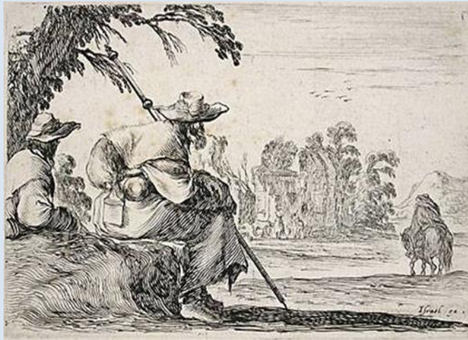
Pilgrims taking a break,' by Jacques Callot

“The Way” (2010), with Martin Sheen https://en.wikipedia.org/wiki/The_Way_(film)