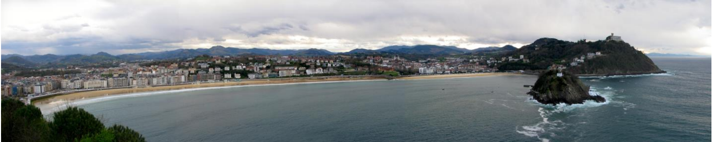
Panoramic view of San Sebastian

medieval bridge, used by thousands of pilgrims in the past, which gave its name to the town. Return to Pamplona in time for dinner in the hotel or in a nearby restaurant.