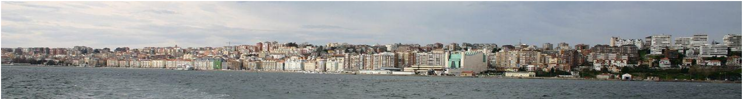
Panoramic view of Santander

Morning visit to the museum of the Altamira Cave , another "Sistine Chapel" and UNESCO site ( http://whc.unesco.org/en/list/310 ), this one of prehistoric art; the cave itself is unfortunately not open to visitors, but the museum features a superb facsimile of the cave paintings. Afterwards we explore the nearby seaport and cosmopolitan resort of Santander , featuring superb beaches, lush gardens, and attractive city centre where there will be some free time for shopping and individual exploring. Return to Santillana in late afternoon and rest of the day at leisure. No group dinner.