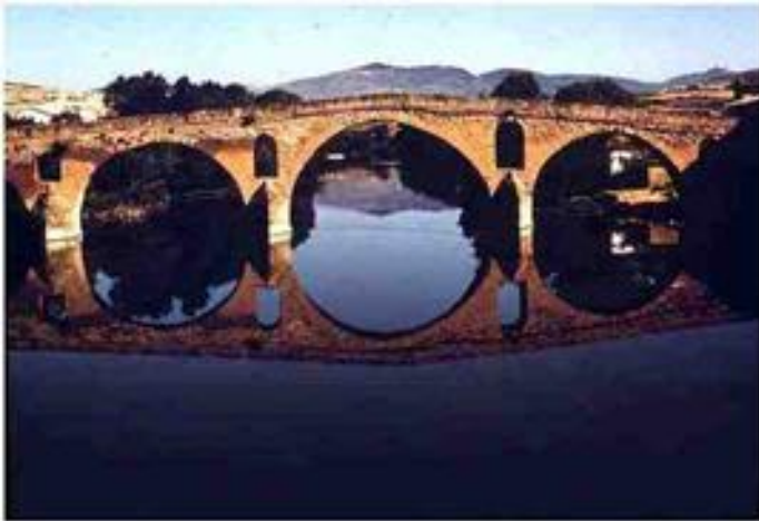
Medieval Bridge of Puente de la Reina

Full-day excursion to nearby San Sebastian, the most beautiful city and resort of the Spanish Basque Country. Highlights will include the superb Concha Beach, comparable to Rio's Copacabana; Monte Igueldo Hill, featuring grandiose panoramic views of the city and the Bay of Biscay; the pretty old town; and the Peine del Viento ("Comb of the Wind"), a quixotic open-air masterpiece of the world-famous Basque sculptor Eduardo Chillida. Also free time to shop and enjoy tapas or a gourmet lunch in this city, Spain's gastronomic Mecca! Return to Pamplona and dinner in the hotel.