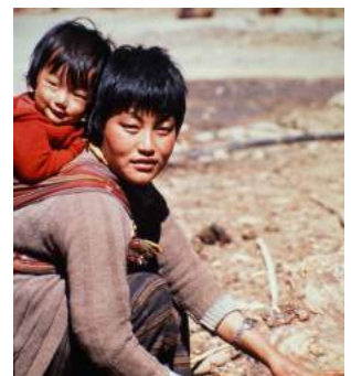
Mother&Child in Farm Field G.Burns