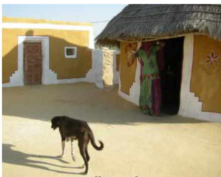
Village, Thar Desert

desert. It is a peaceful place with houses of mud and straw decorated like the patterns of Persian carpets. Enjoy a ride on camel back and let the place itself take you to its mesmerizing heights. Get closer to the local way of living with a close view of thatched straw roofs, camels, narrow streets and the local bazaar. As the day passes, we gather around a campfire, listen to the songs of