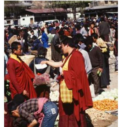
The bustling Thimphu market G.Burns