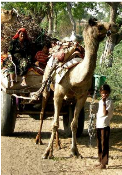
En-route to Pushkar

Our first stop following breakfast at the hotel is at the Barefoot College in Kishangarh, then we continue to Pushkar a mellow, serene and bewitching little town which attracts those in search of some respite from the tumult of India. Pushkar is right on the edge of the desert. This traveler-friendly town clings to the side of the small Pushkar Lake with its many bathing ghats and temples. Because