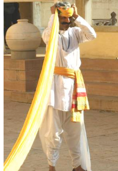
Turban wrapping lesson, Meherangarh Fort.