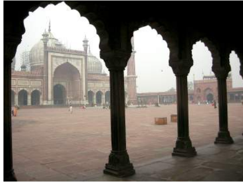
Jama Masjid, Old Delhi

After breakfast we will be given a tour of India's capital city beginning in Old Delhi the former seat of Mughal Power with its ancient monuments, narrow streets and bustling bazaars. Driving past the vast Red Fort, built in 1648, we visit the Gurdwara Bangla Sahib Sikh Temple, the Raj Ghat, a memorial to Mahatma Gandhi and the Jama Masjid, the greatest mosque in India completed in 1658 by Shah Jehan. Following lunch we make our way to