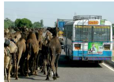
En-route to Pushkar

Our first stop following breakfast at the hotel is at the Barefoot College in Kishangarh, then we continue to Pushkar a mellow, serene and bewitching little town which attracts those in search of some respite from the tumult of India. Pushkar is right on the edge of the desert. This traveler-friendly town clings to the side of the small Pushkar Lake with its many bathing ghats and temples. Because