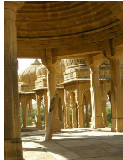
Rawalsin Bada baah Pavilions