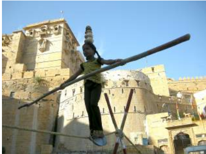
Tightrope Walker, Jaisalmer Fort

One of the main attractions is the imposing 12th century Jaisalmer Fort. This morning we stroll through this fortified Rajput desert community built in 1156 by Rawal Jaisal. One fourth of the population of Jaisalmer lives