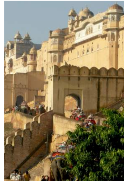
Elephant ride to the Amber Fort, Jaipur