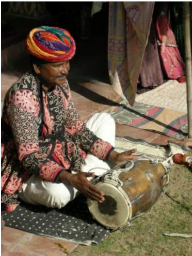
Street Scenes Jaipur

Breakfast at the hotel before we begin our tour of Jaipur, the bustling capital of Rajasthan.