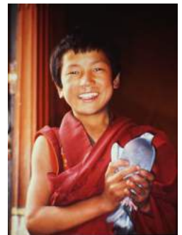
Young Monk with Pigeon