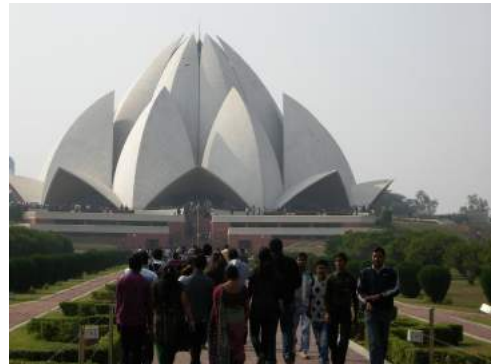
Lotus Temple, Delhi

We leave by bus after breakfast, stopping en-route to visit the Swaminarayan Akshardham epitomizing 10,000 years of Indian culture, and the expressive contemporary Lotus Temple of the Bahai faith before continuing to Agra.