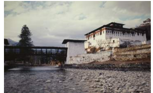
Rinpung Dzong, Paro