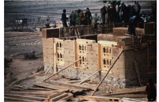
Building a Pounded Earth Home G.Burns