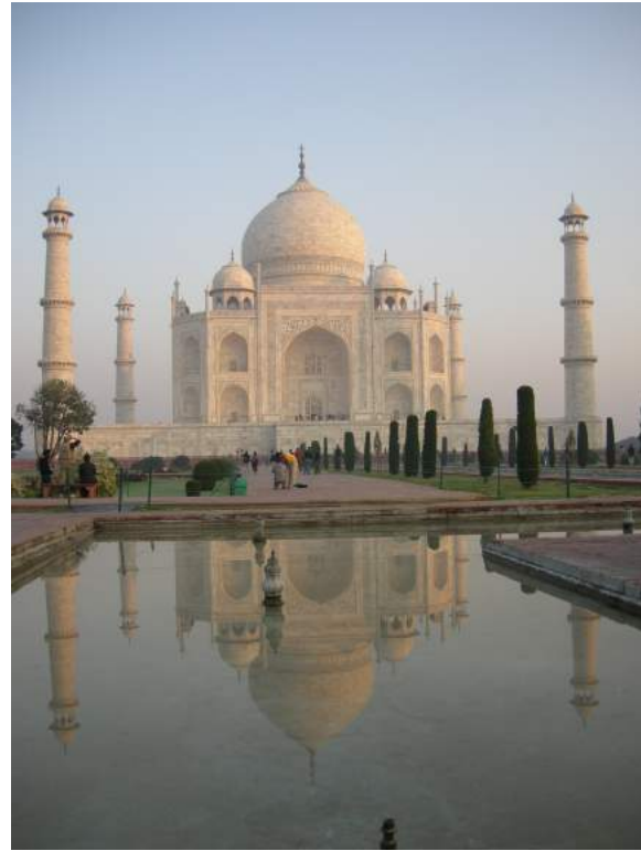
Sunrise, Taj Mahal, Agra

After breakfast at the hotel an amazing day in Agra begins with a sunrise visit to the most admired of Mughal structural and landscape architecture the serene Taj Mahal . Little needs to be said about this artistic wonder built by Shah Jahan, as a loving memorial to his beautiful wife Mumtaz Mahal. This monument, taking 22 years to complete, is extolled for its superb symmetry, elegant contours, intricately carved marble jaali ( lattice screens ) and intarsia. We return to the hotel for breakfast followed by a visit to Agra Fort lying on the bend of the river Yamuna with a view of the Taj from its walls. From 1563-73 Akbar built the fort as his citadel employing a majestic mix of Indo Islamic styles. It has imposing gates and massive walls of red sandstone. The superb jaali in the scalloped arches of the Moti Masjid ( Pearl Mosque ), created during the reign of