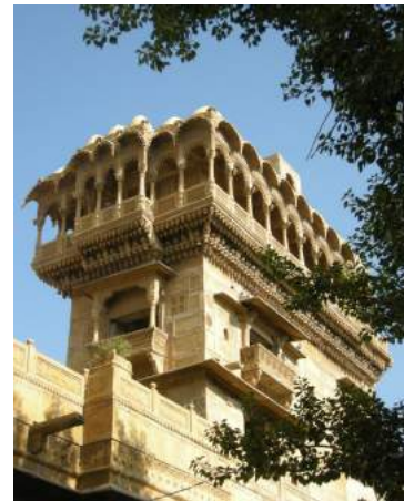
Salam Sina Ki Haveli

inside the Fort, which rises triumphantly above the shimmering city of stone it commands. Inside the fort we visit the Jain Temple, and palace. After lunch we take a walking tour through the lower city to visit the Patwan-Ki and other elaborately carved sandstone havelis built by wealthy merchants.