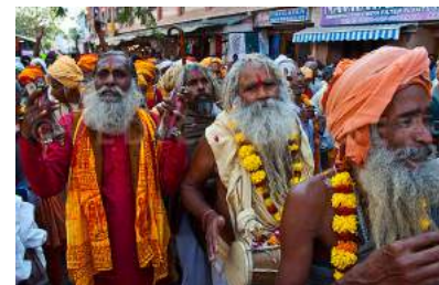
Sadhus on pilgrimage to the Brahma Temple, Pushkar

Pushkar is a very important Hindu pilgrimage centre it attracts many Sadhus (individuals on a spiritual search). Upon arrival check in at the tented accommodation / hotel. After lunch we take a stroll through Pushkar with its many temples, and bathing ghats. Most famous of the temples is the Brahma Temple, one of only two in India dedicated to this deity. It's marked by a red spire, and over the entrance gateway is the Hans, or