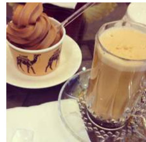
Camel Milk Chocolate Ice-cream and Camel Milk Chai

Today we travel by bus to Bikaner. Pass by the Lallgarh Palace, a small beautiful palace of the Maharajah of Bikaner as we arrive in the city. Shortly after lunch tour the Rajput Junagarh fort and its fabulous palaces built by Rai Singh between 1588 and 1593, which has a 986-metre-long wall with 37 bastions. “One hump or two?” Try some camel milk ice cream during a visit to the government-managed Camel Research and Breeding Farm the only one of its kind in Asia.