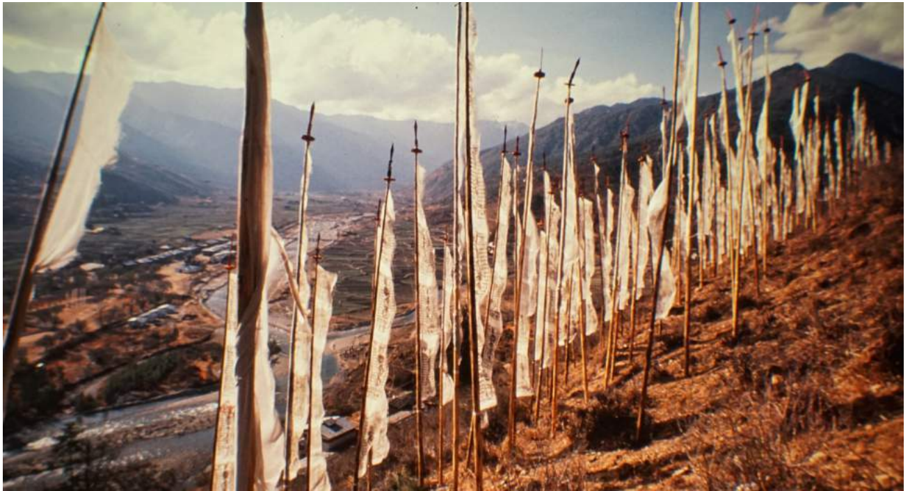
Prayer Flags G.Burns

Say farewell to Bhutan as we transfer to the airport for 1hr. flight to Delhi. In Delhi, you will be met on arrival and transferred to the hotel. Rest of the day at leisure to pursue individual interests. Optional Tour: The National Museum of India which has over 200,000 works of art, of both Indian and foreign origin, covering more than 5,000 years of the rich cultural heritage.