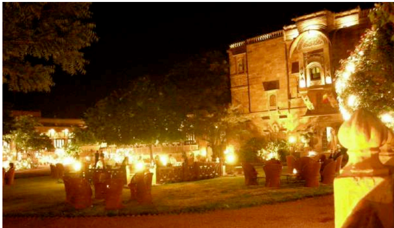
Evening Garden, Fort Chanwa Hotel,