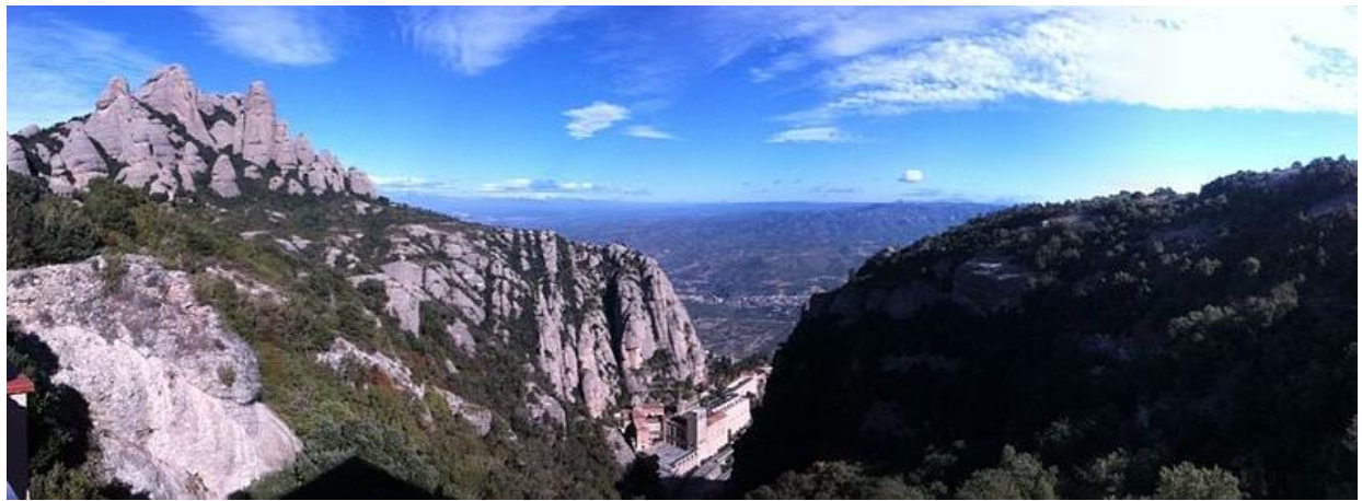
Monastery and mountains of Montserrat (Wikimedia Photo by Jahidalgoalov

<u>Day 6 - Wednesday, November 23</u>: (B, L) After breakfast, excursion by private coach to the Benedictine Monastery of Montserrat, situated high in the rugged Montserrat mountains that rise behind Barcelona ( https://en.wikipedia.org/wiki/Santa_Maria_de_Montserrat_Abbey ). This is the national sanctuary as well as the major cultural centre of Catalonia and the home of La Moreneta , the Black Madonna, the Catalan patron saint. <u>Lunch</u> of traditional Catalan specialties in a country restaurant. Return to Barcelona and free afternoon. Tonight, optional Flamenco show, with or without dinner!