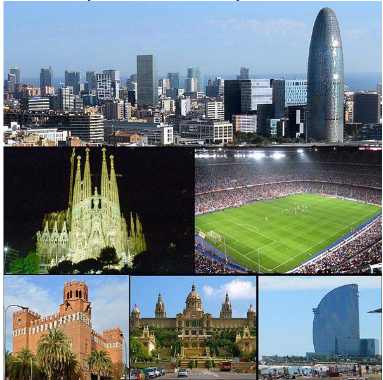
Sights of Barcelona

Pauwels Travel Bureau Ltd. 95 Dalhousie Street, Brantford, Ontario N3T 2J1, Canada Tel: 519-756-4900 / 519-753-2695 - Fax: 519-753-6376 tours@pauwelstravel.com – www.pauwelstravel.com