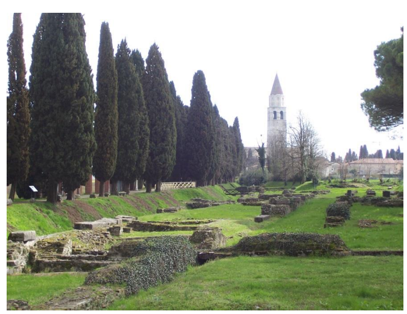
Archaeological site of Aquileia