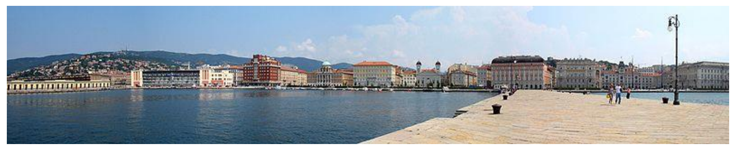
Trieste's glorious waterfront

<u>Day 10 - Thursday, April 26</u>: Sidetrip to the archaeological area and the Patriarchal Basilica of Aquileia , terminus of Antiquity's Amber Road, linking the Adriatic, and the Mediterranean Sea in general, to the Baltic Sea, one of the largest and wealthiest cities of the Roman Empire, destroyed by Attila in the 5th century, another UNESCO site (http://whc.unesco.org/en/list/825). We also visit Udine , the charming capital of Italy's Friuli Province, before returning to Trieste in late afternoon via an area where many battles were fought between Italian and Austrian troops in WW I. No group dinner this evening.