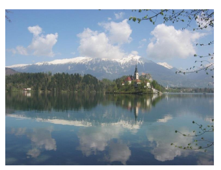
Fabulous Lake Bled, surrounded by Alpine peaks

Day 12 - Saturday, April 28: Morning sightseeing tour of nearby with focus on the attractive old town; highlights will include the major squares with their fountains, statues, and imposing buildings such as city hall and the Slovenian Parliament, Triple Bridge and Dragon Bridge, the Open Market, and Ljubljana Castle, high on a hill with superb views of the city. Then we take a sidetrip to nearby Bled , an exquisite resort in the Alps, nestled on the shores of a lake surrounded by towering mountain peaks. After our visit and a boat tour on the lake, we return to Ljubljana. Today, group lunch OR dinner featuring Slovenian specialties in a typical restaurant.