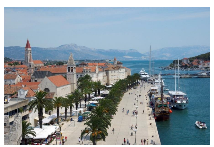
The old town of Trogir

Day 4 - Friday, April 20: Today we motor for a total distance of about 200km through Croatia's rugged interior, stretching along the Bosnian border, via towns such as Gracac and Knin, to the beautiful Dalmatian Coast. Our destination is picturesque Sibenik , the oldest Croatian town on the Adriatic Sea, ruled for many centuries by outsiders such as the Venetians and the Austro-Hungarians. Dinner and overnight in a 4-star beachfront hotel a few miles away from the city centre, the Amadria Park Hotel Jure (www.solarishotelsresort.com/wh/hotel-jure-en).