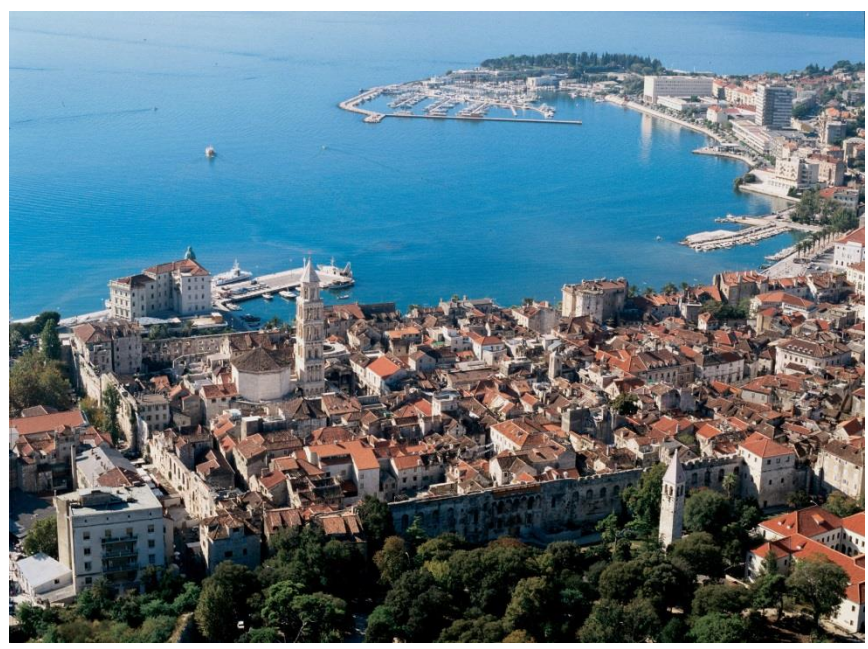
Split in Dalmatia, jewel of Croatia's Adriatic coast

<u>Day 6 - Sunday, April 22</u>: Full-day excursion to two nearby UNESCO World Heritage Sites. First, Trogir , a quaint coastal community with ancient Greek origins and plenty of medieval, Renaissance, and baroque buildings (http://whc.unesco.org/en/list/810). Second, the ancient city of Split , with its magnificent seafront and ruins of the palace of Roman Emperor Diocletian, built around 300AD (http://whc.unesco.org/en/list/97). Return to Sibenik - along the scenic coastal road . . . if time permits! - and dinner in the hotel.